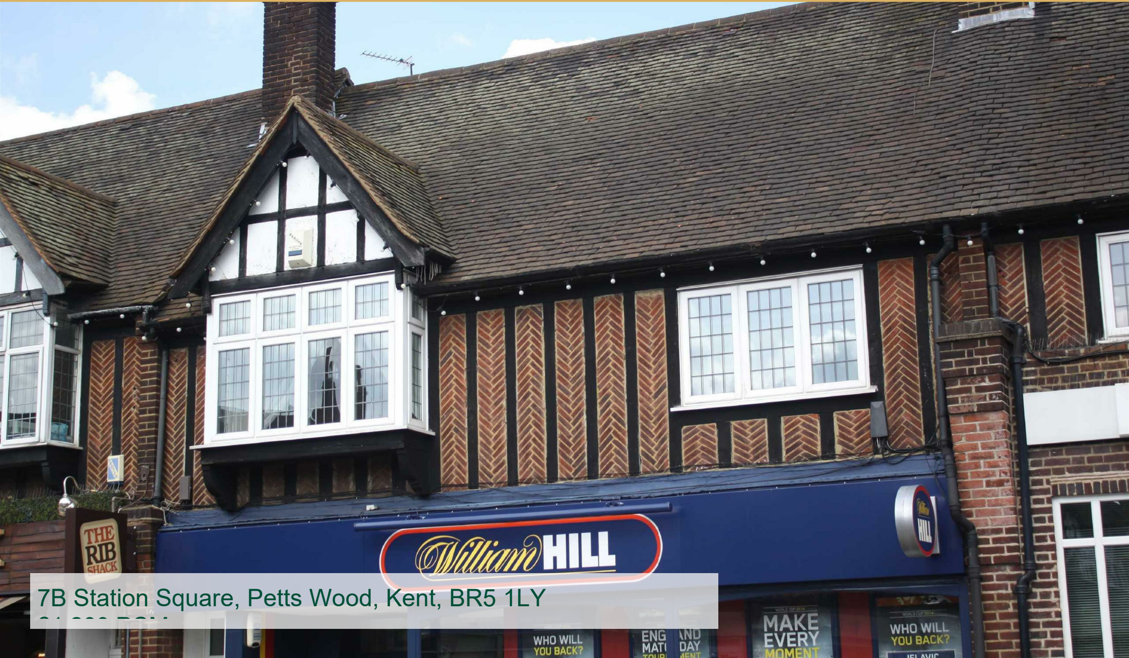
7B Station Square, Petts Wood, Kent, BR5 1LY