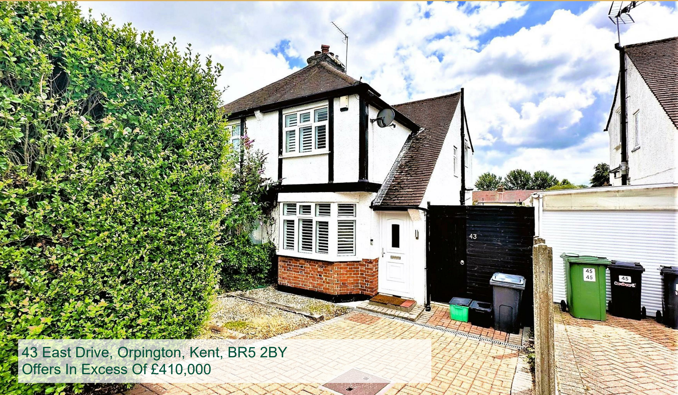
43 East Drive, Orpington, Kent, BR5 2BY Offers In Excess Of £410,000