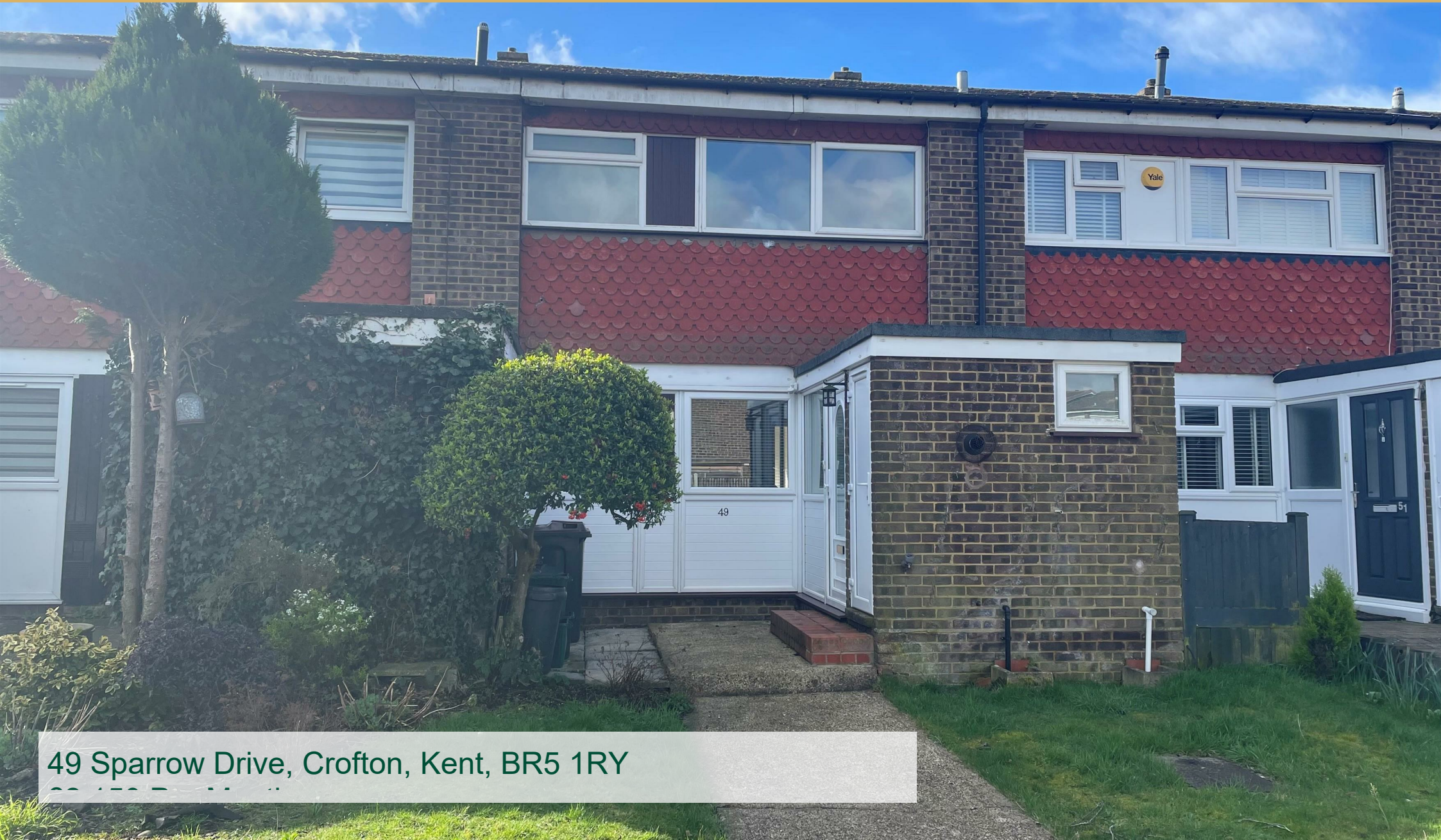
49 Sparrow Drive, Crofton, Kent, BR5 1RY