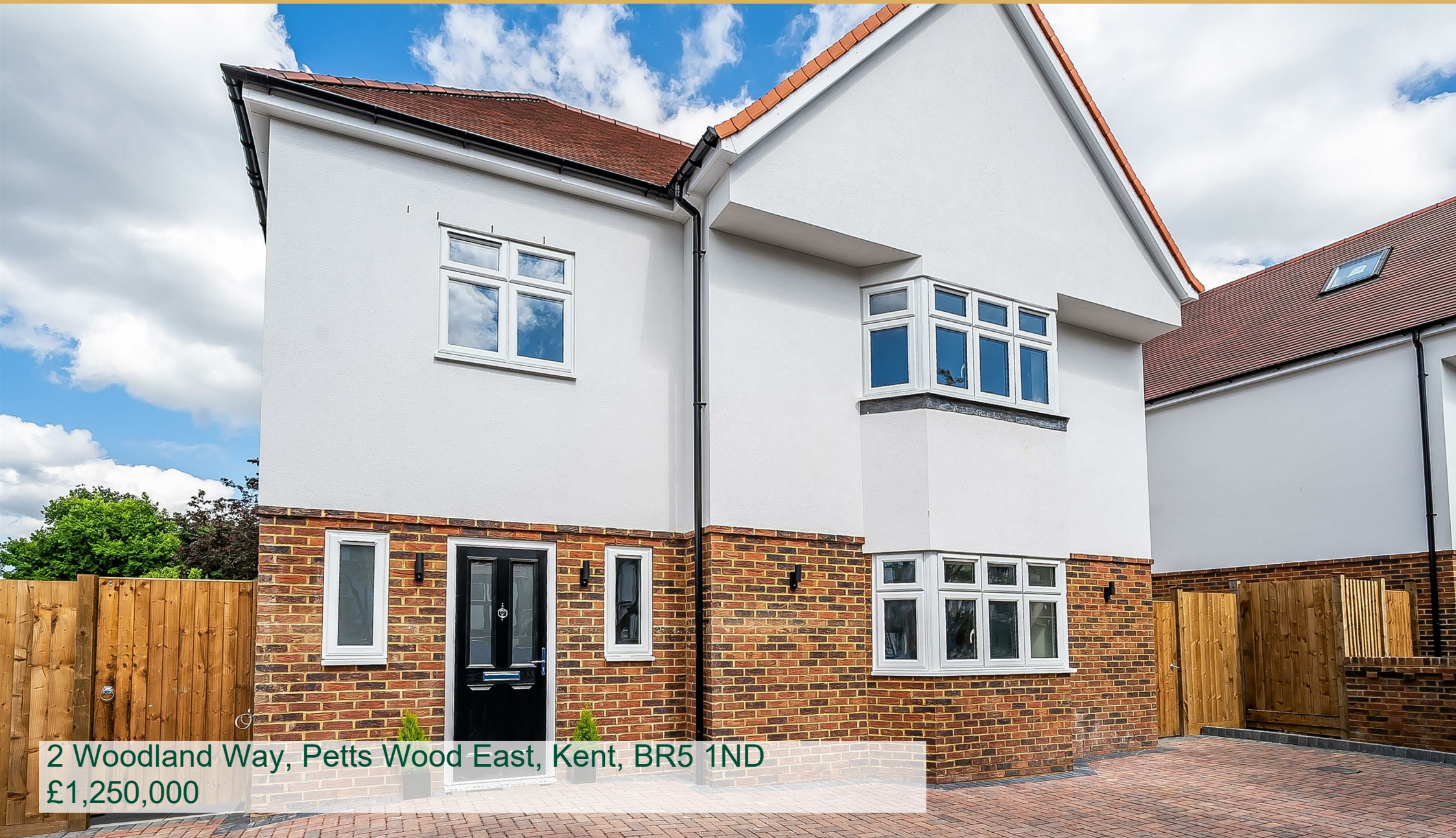
2 Woodland Way, Petts Wood East, Kent, BR5 1ND £1,250,000