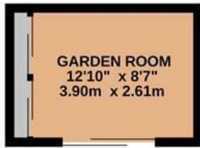
GROUND FLOOR 492 sq.ft. (45.7 sq.m.) approx.