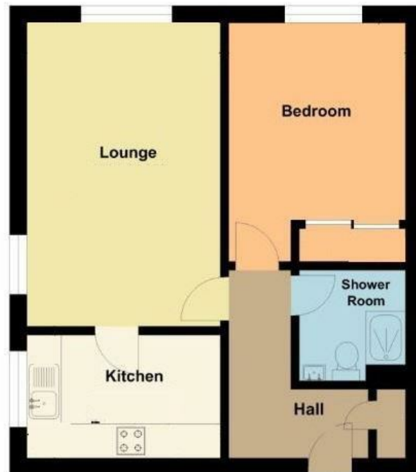
Summerlands Lodge APPROX. GROSS INTERNAL FLOOR AREA 539.91 SQFT / 50.16 SQM