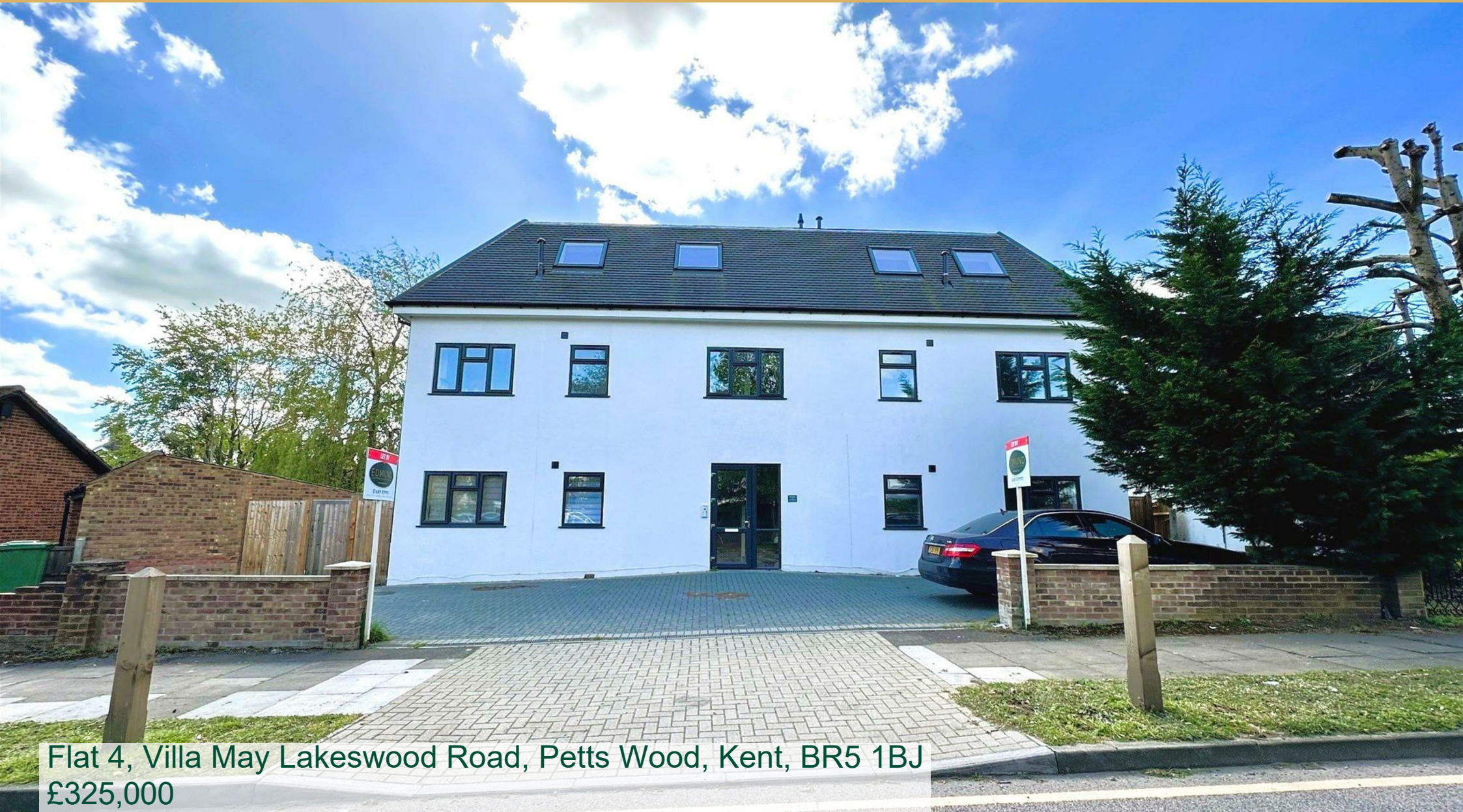
Flat 4, Villa May Lakeswood Road, Petts Wood, Kent, BR5 1BJ £325,000