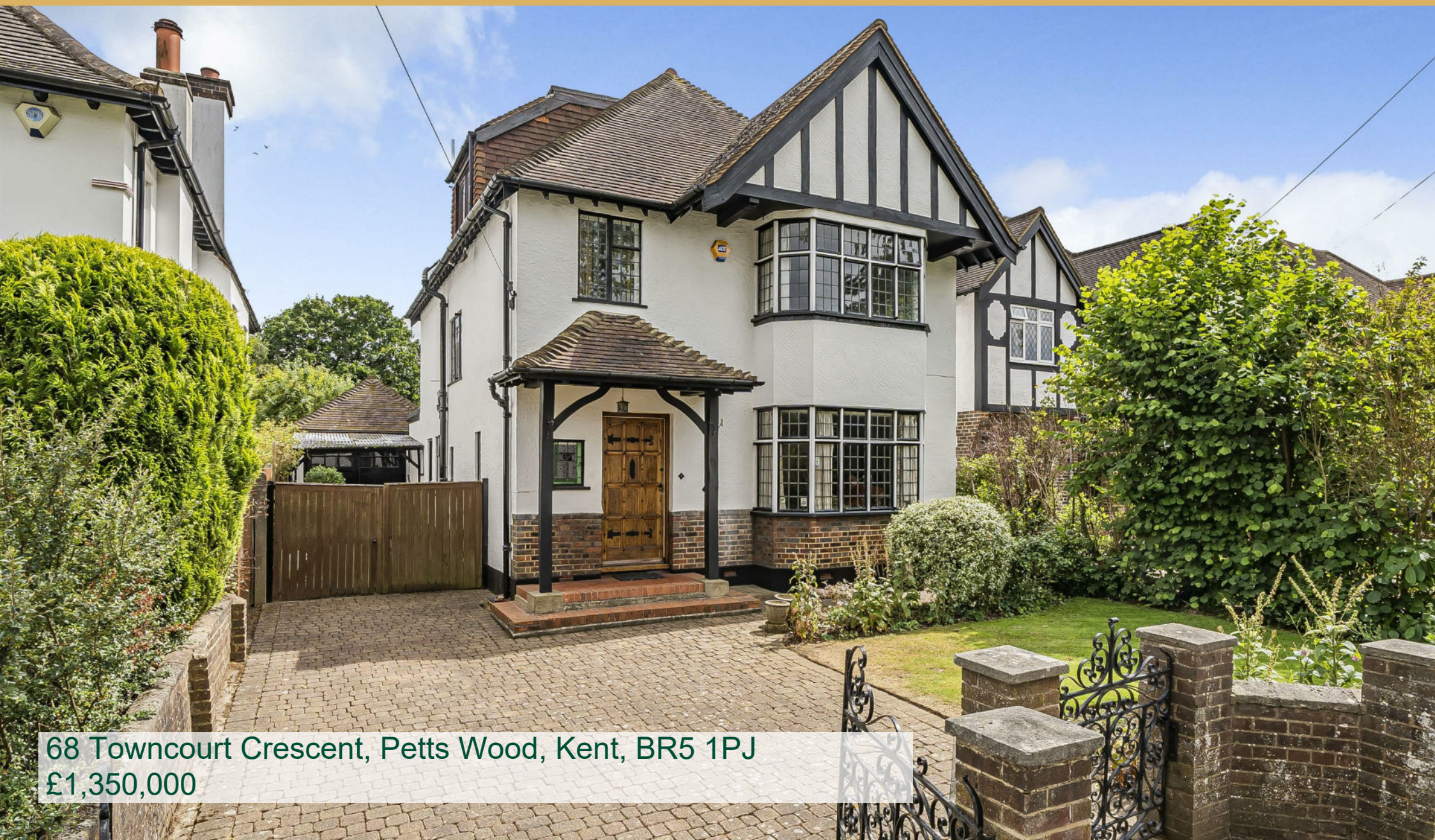
68 Towncourt Crescent, Petts Wood, Kent, BR5 1PJ £1,350,000