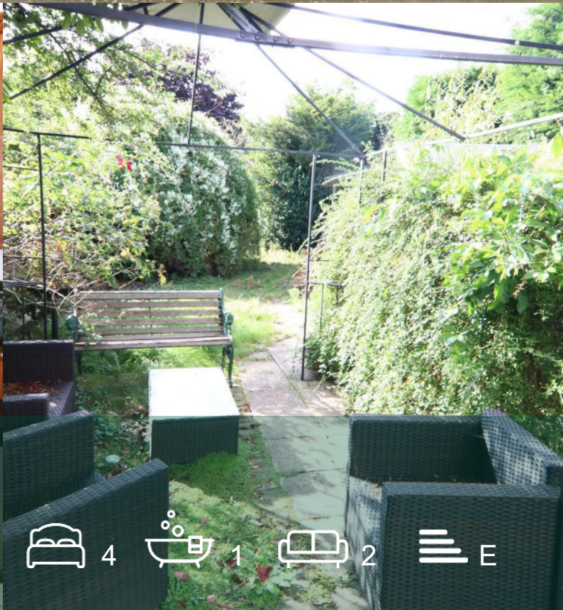
Derry Downs , Orpington, BR5 4DT £650,000 Freehold