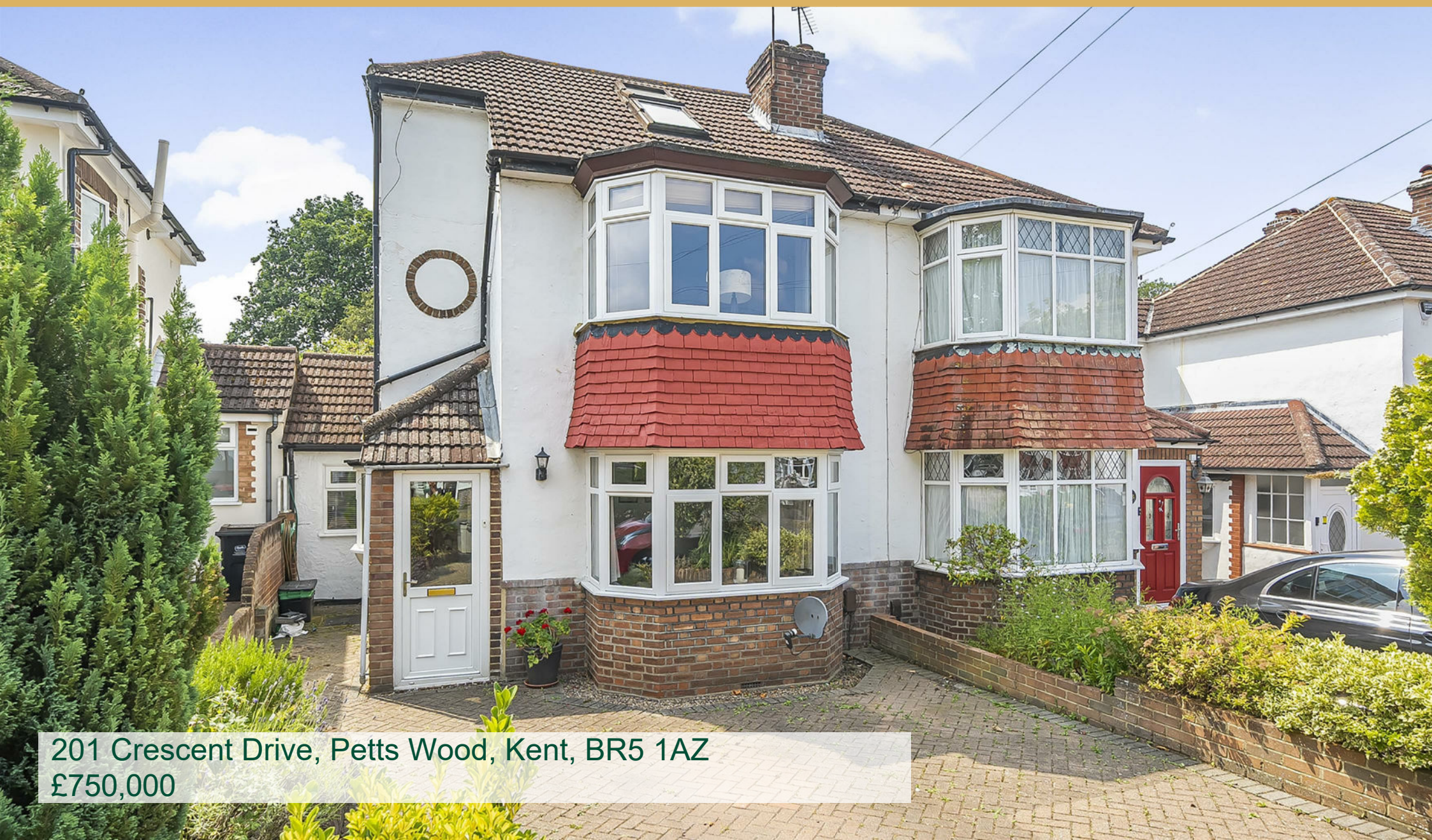
201 Crescent Drive, Petts Wood, Kent, BR5 1AZ £750,000