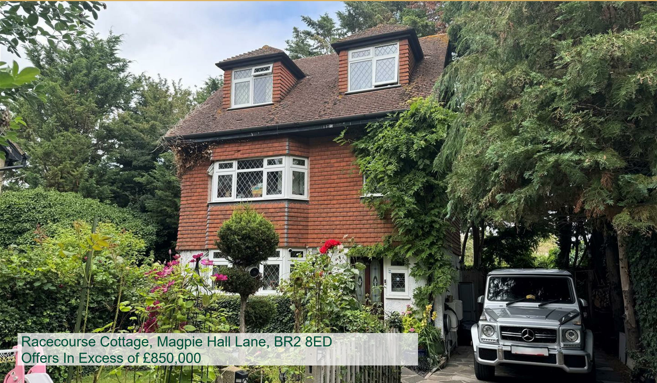
Racecourse Cottage, Magpie Hall Lane, BR2 8ED Offers In Excess of £850,000