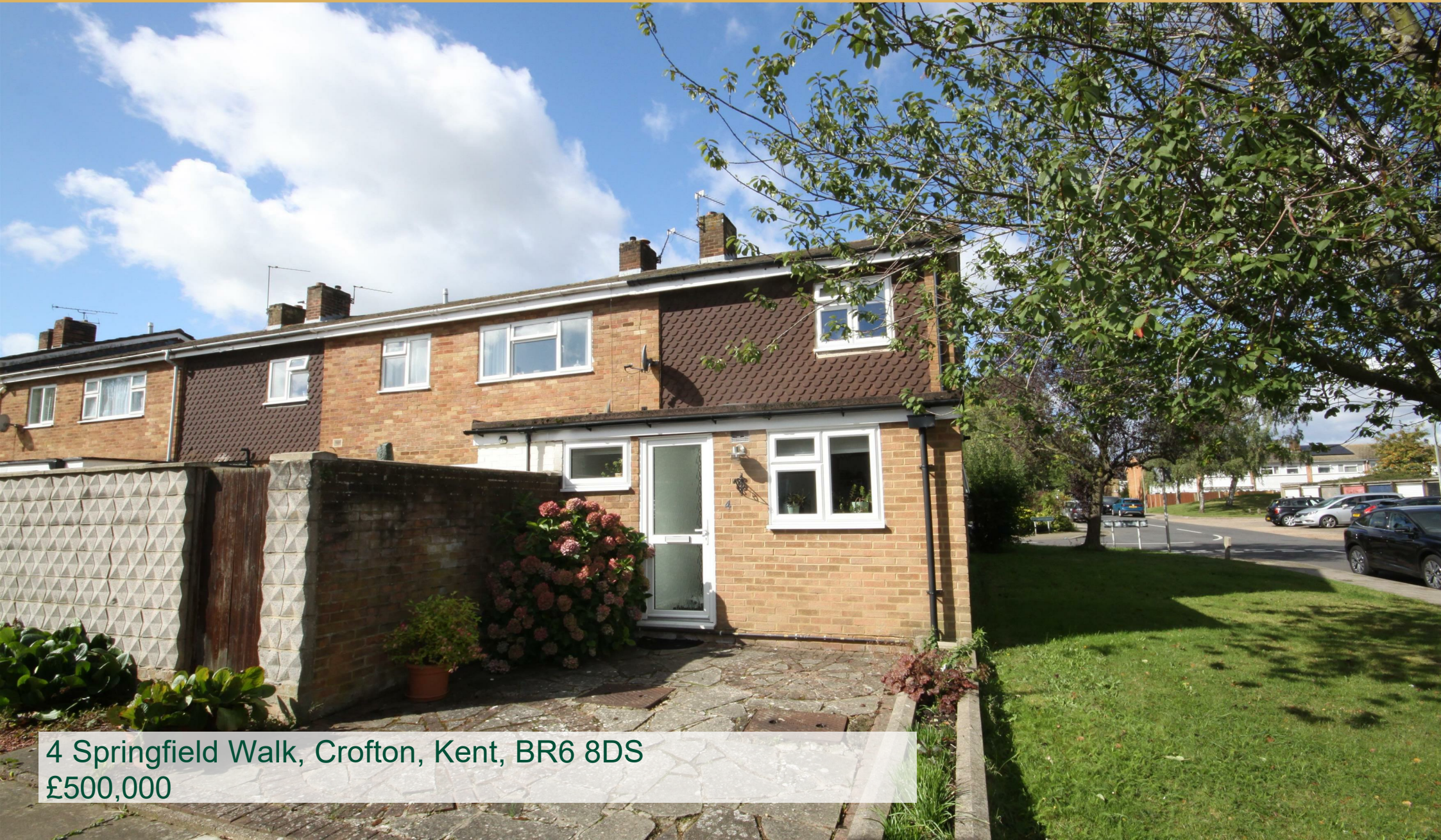
4 Springfield Walk, Crofton, Kent, BR6 8DS £500,000