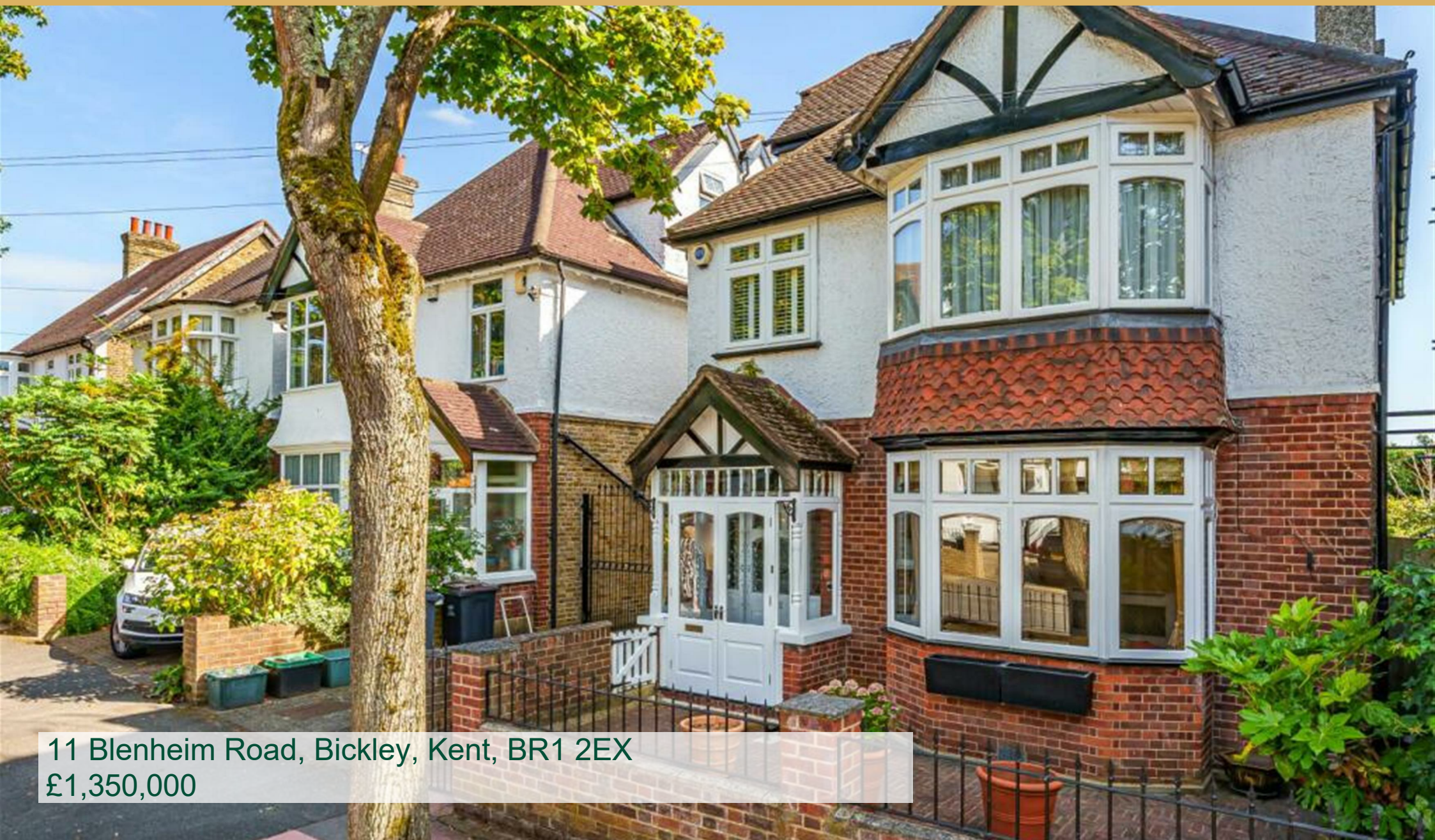
11 Blenheim Road, Bickley, Kent, BR1 2EX £1,350,000