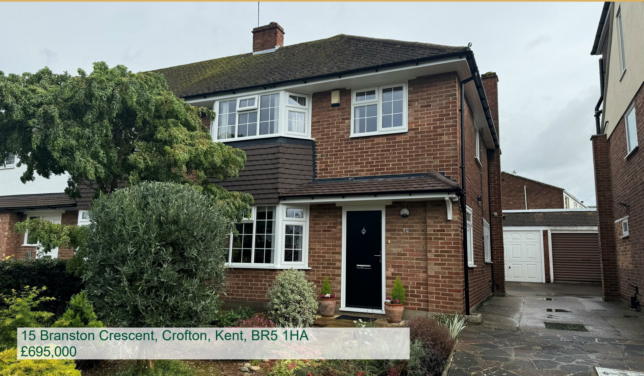
15 Branston Crescent, Crofton, Kent, BR5 1HA £695,000