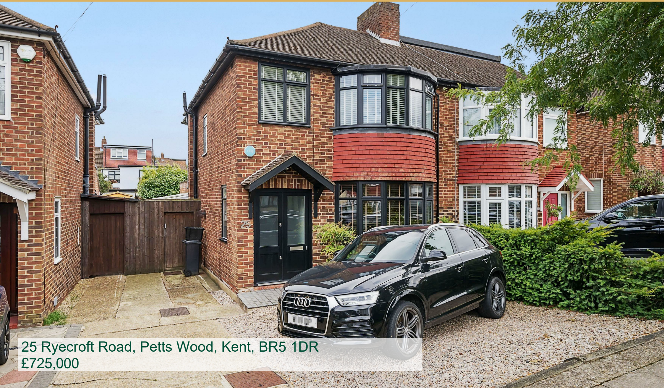
25 Ryecroft Road, Petts Wood, Kent, BR5 1DR £725,000