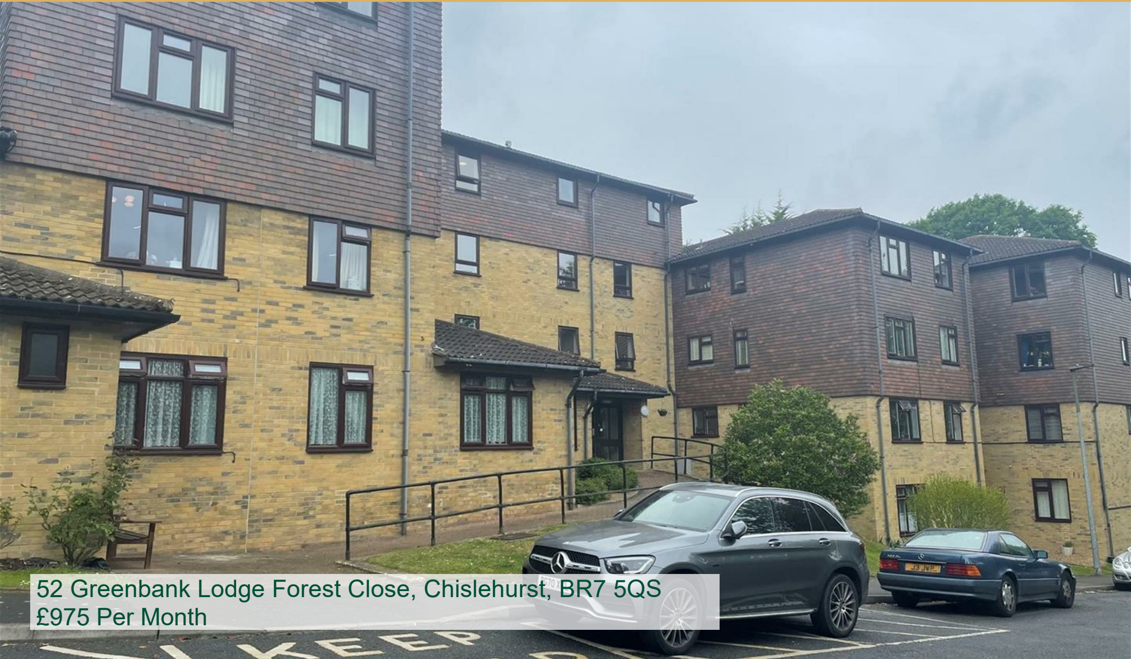
52 Greenbank Lodge Forest Close, Chislehurst, BR7 5QS £975 Per Month