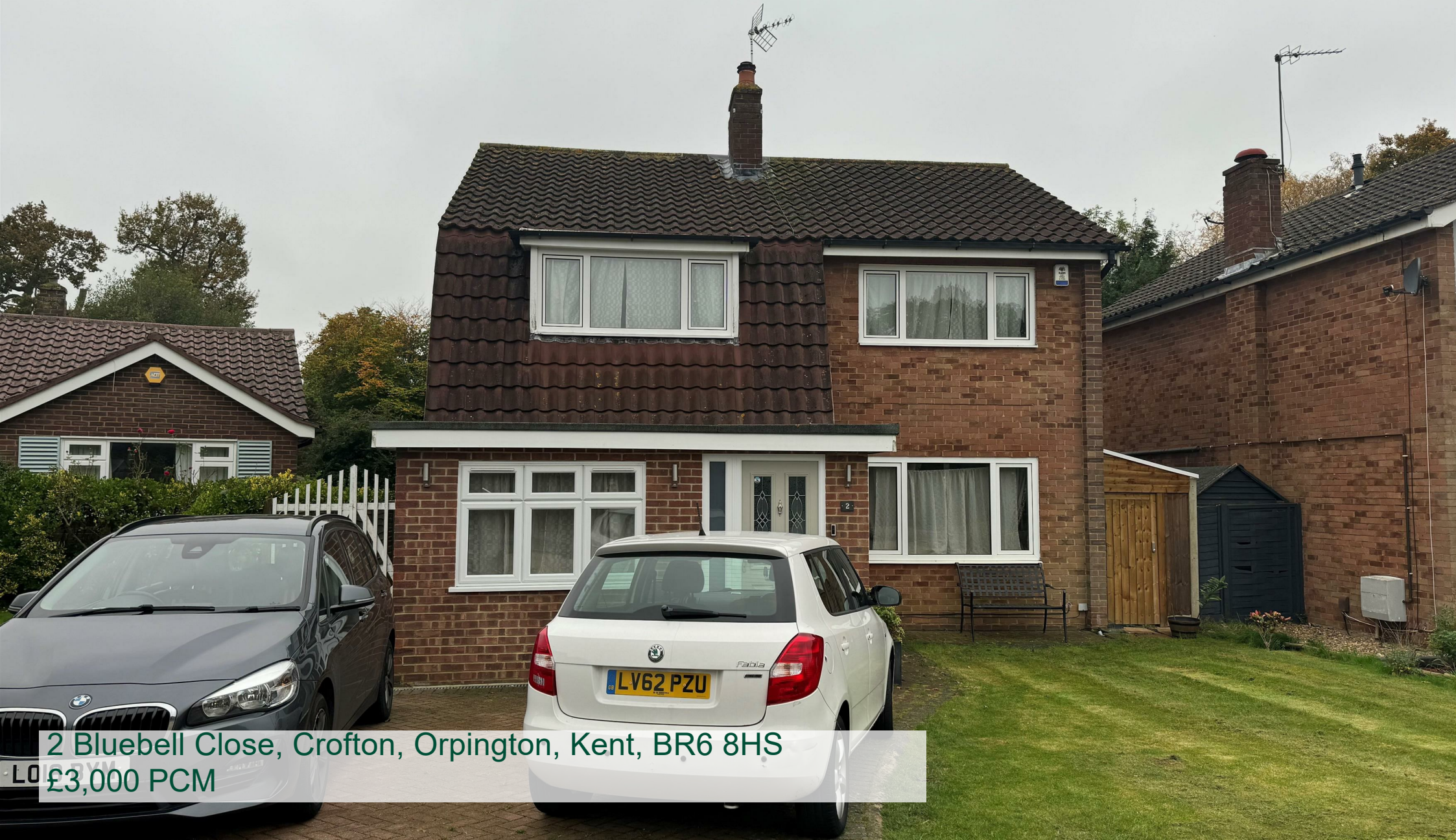
2 Bluebell Close, Crofton, Orpington, Kent, BR6 8HS £3,000 PCM