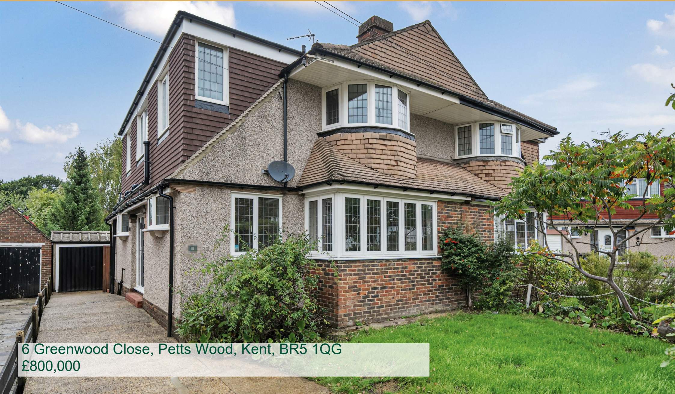
6 Greenwood Close, Petts Wood, Kent, BR5 1QG £800,000