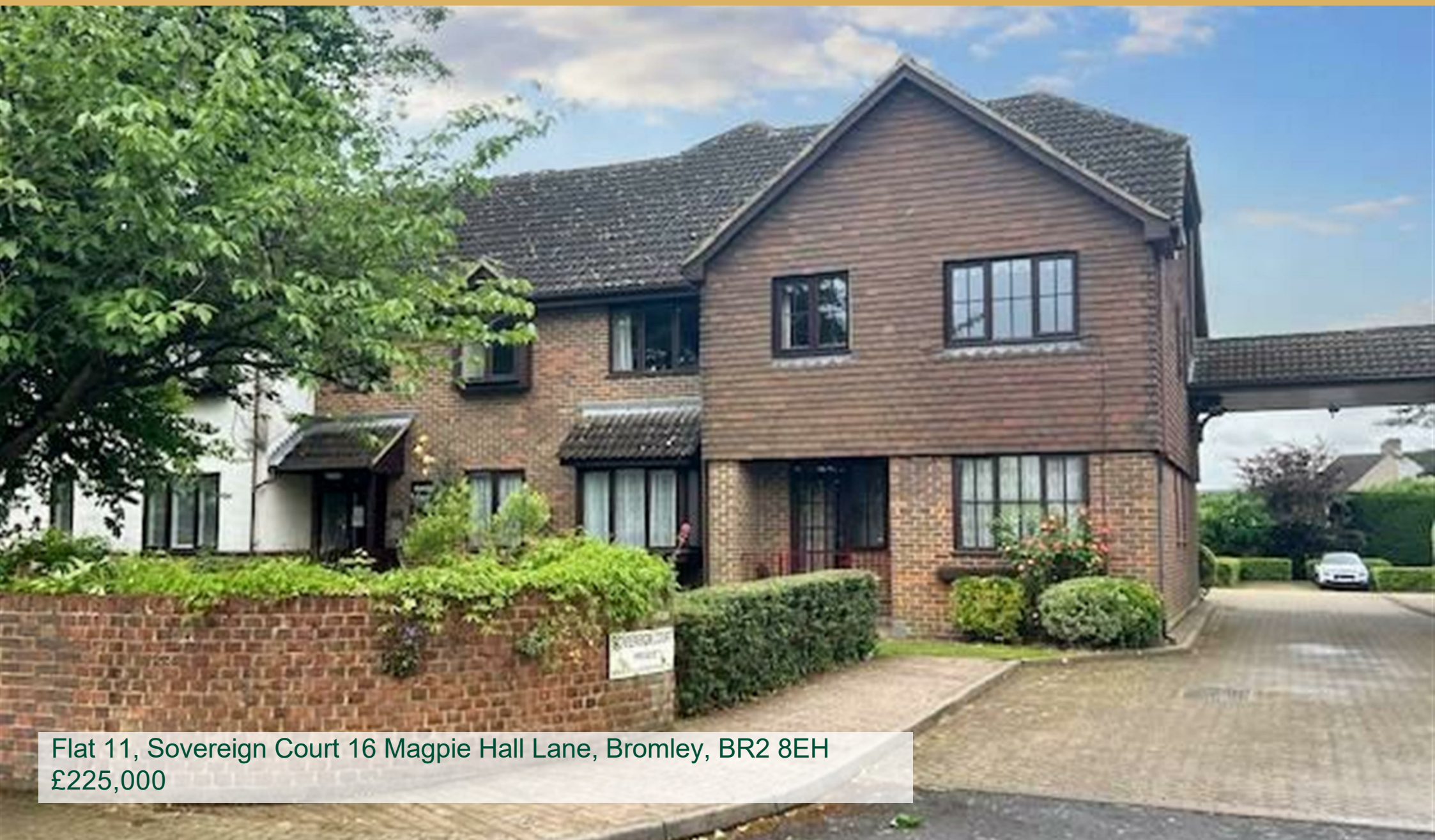
Flat 11, Sovereign Court 16 Magpie Hall Lane, Bromley, BR2 8EH £225,000