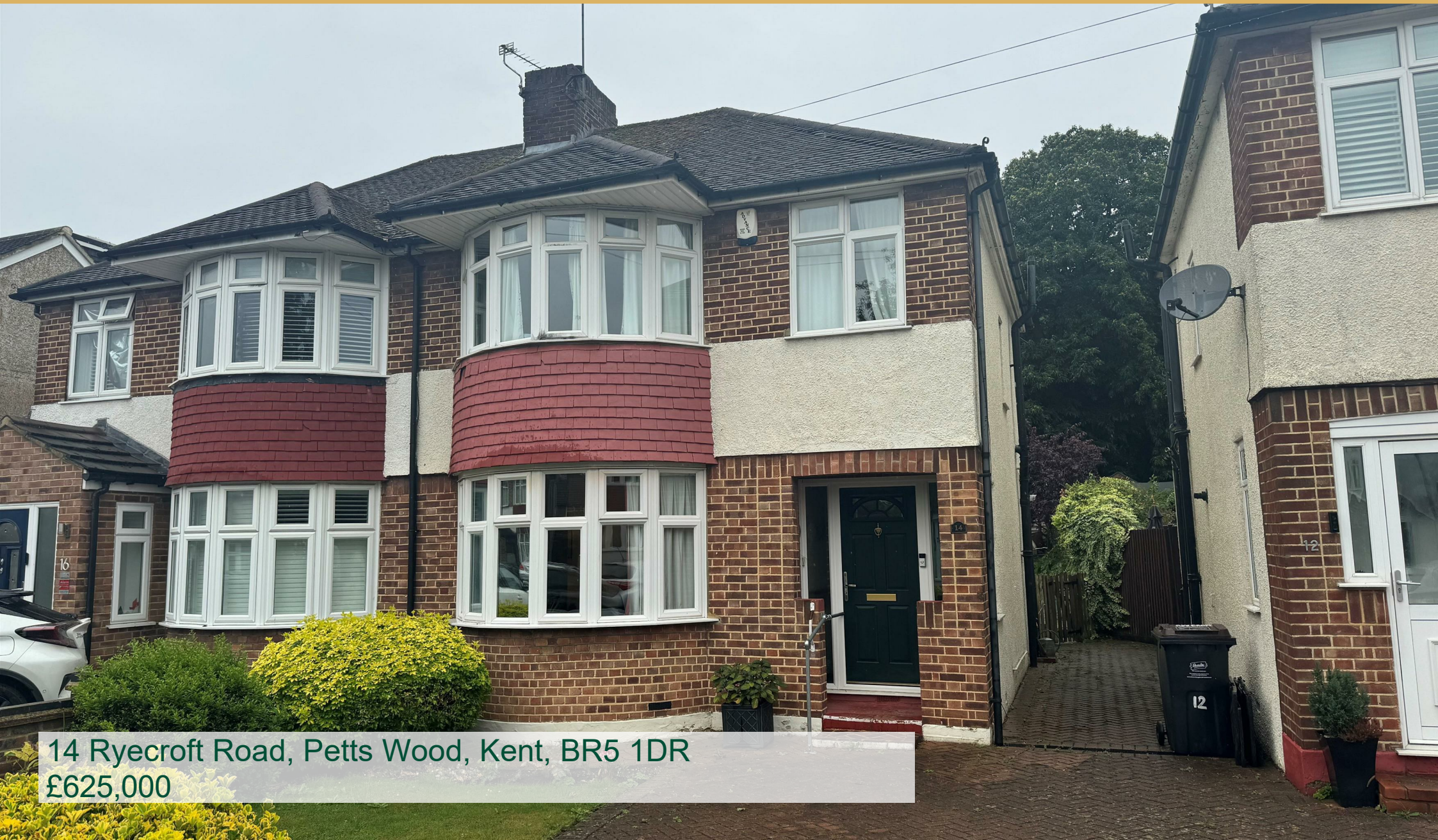
14 Ryecroft Road, Petts Wood, Kent, BR5 1DR £625,000