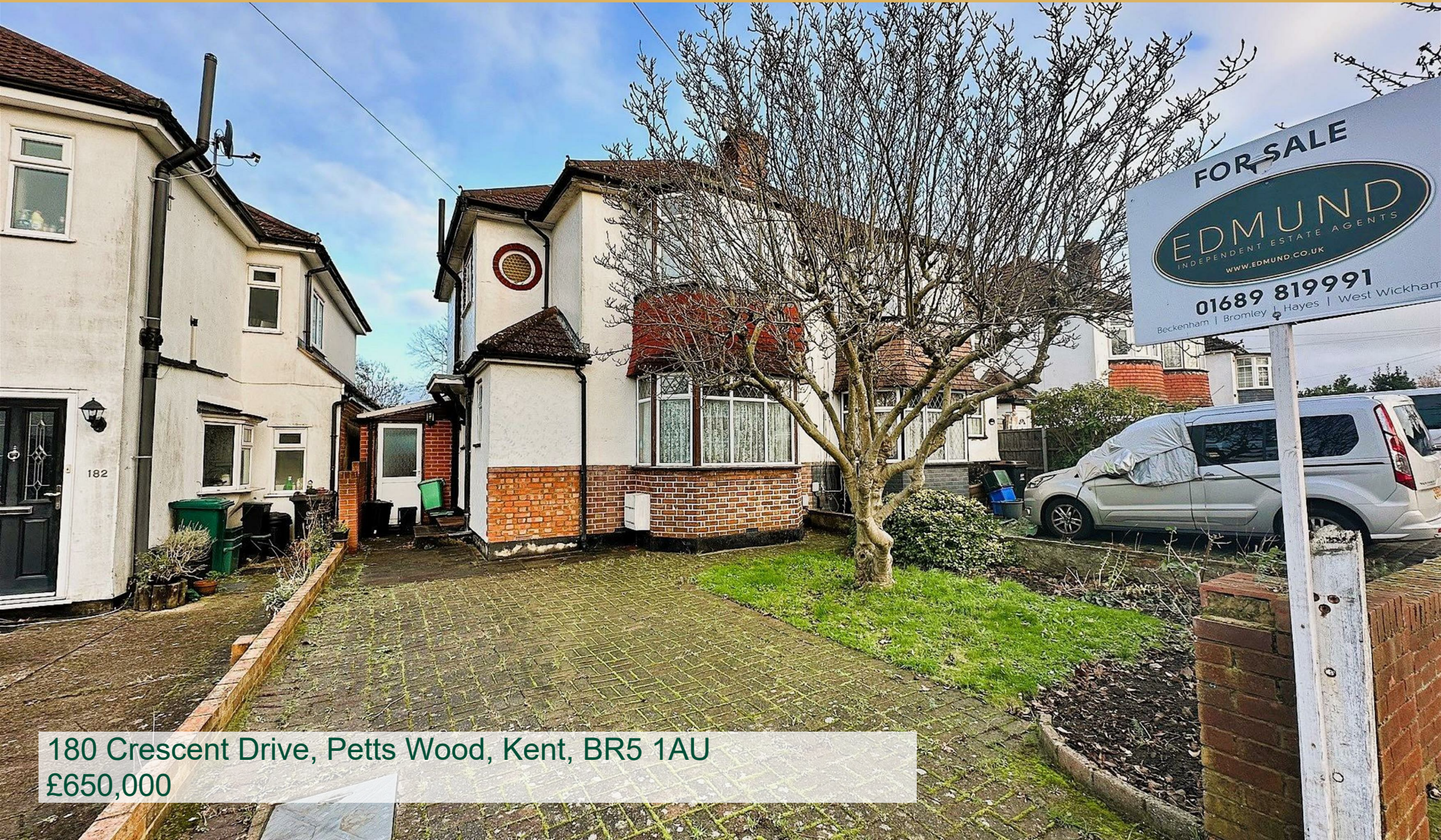
180 Crescent Drive, Petts Wood, Kent, BR5 1AU £650,000