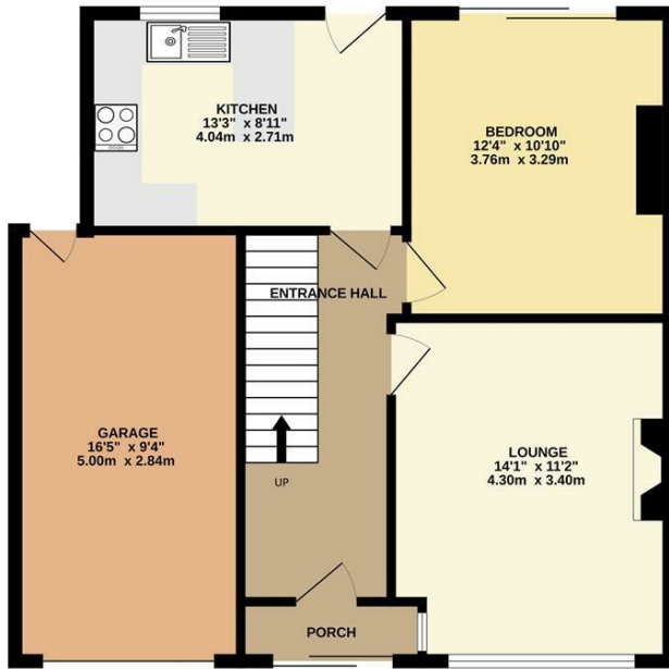
1ST FLOOR 441 sq.ft. (41.0 sq.m.) approx.