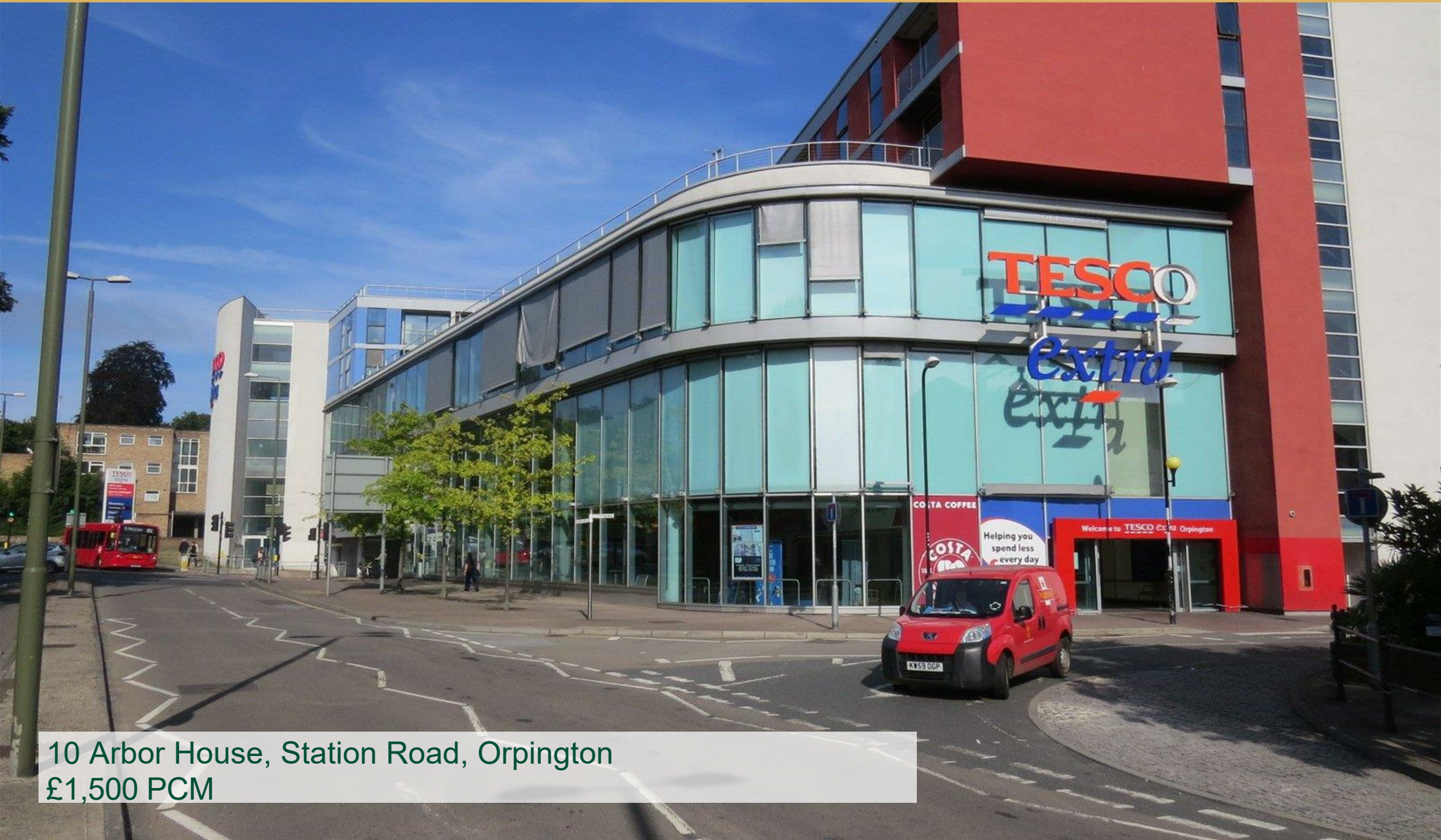
10 Arbor House, Station Road, Orpington £1,500 PCM