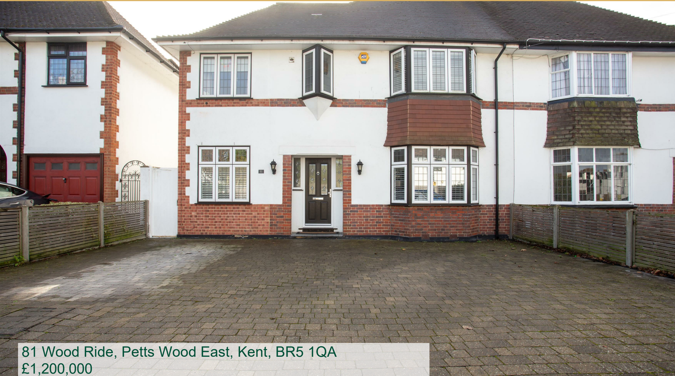
81 Wood Ride, Petts Wood East, Kent, BR5 1QA £1,200,000