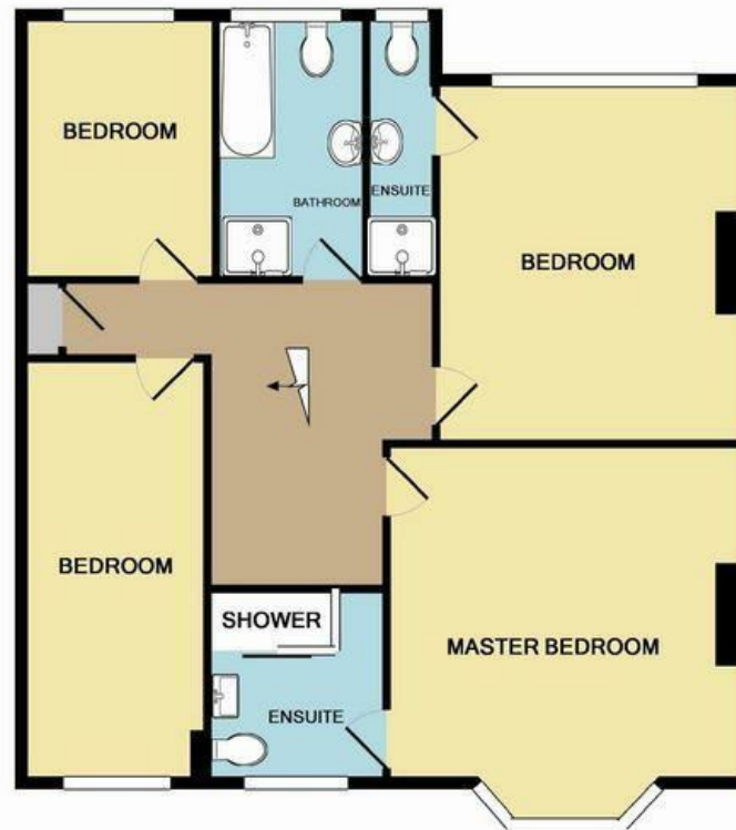
1ST FLOOR APPROX. FLOOR AREA 792 SQ.FT. (73.6 SQ.M.)

TOTAL APPROX. FLOOR AREA 1594 SQ.FT. (148.1 SQ.M.)