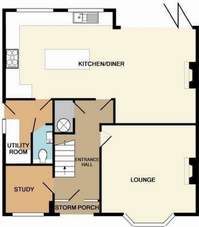
GROUND FLOOR APPROX. FLOOR AREA 802 SQ.FT. (74.5 SQ.M.)