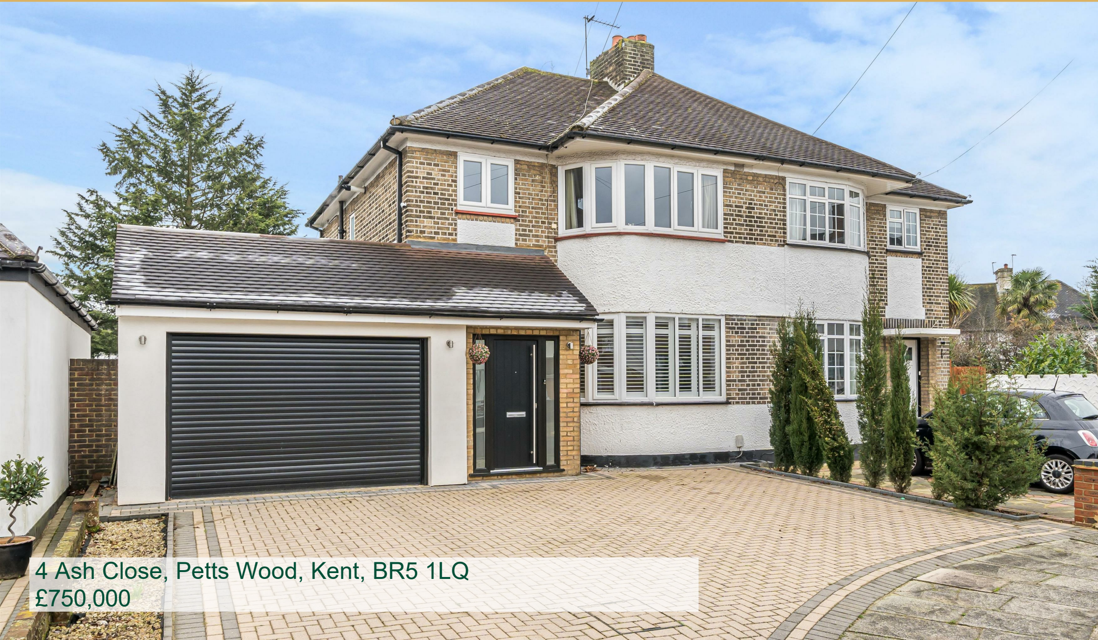
4 Ash Close, Petts Wood, Kent, BR5 1LQ £750,000