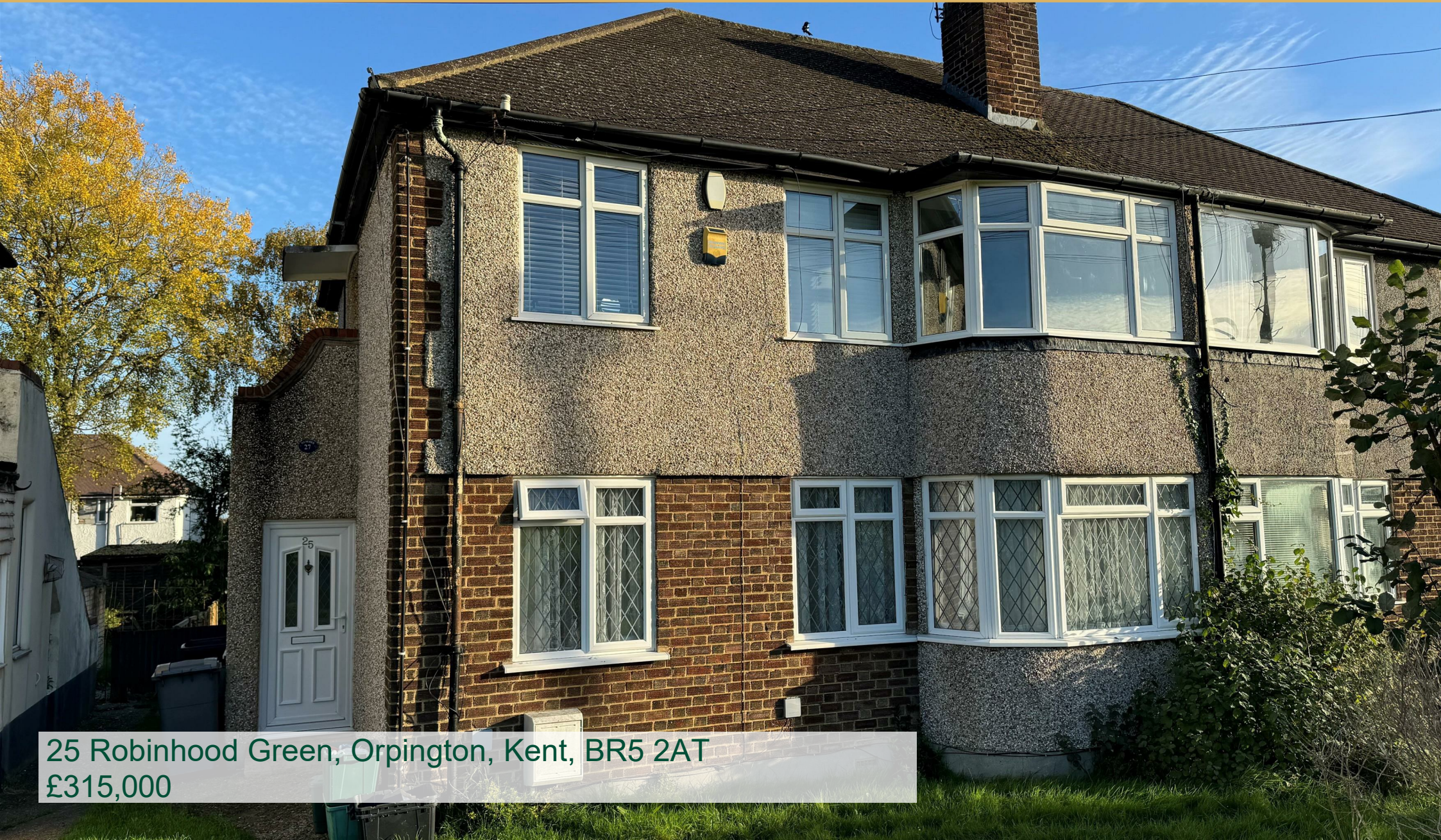
25 Robinhood Green, Orpington, Kent, BR5 2AT £315,000