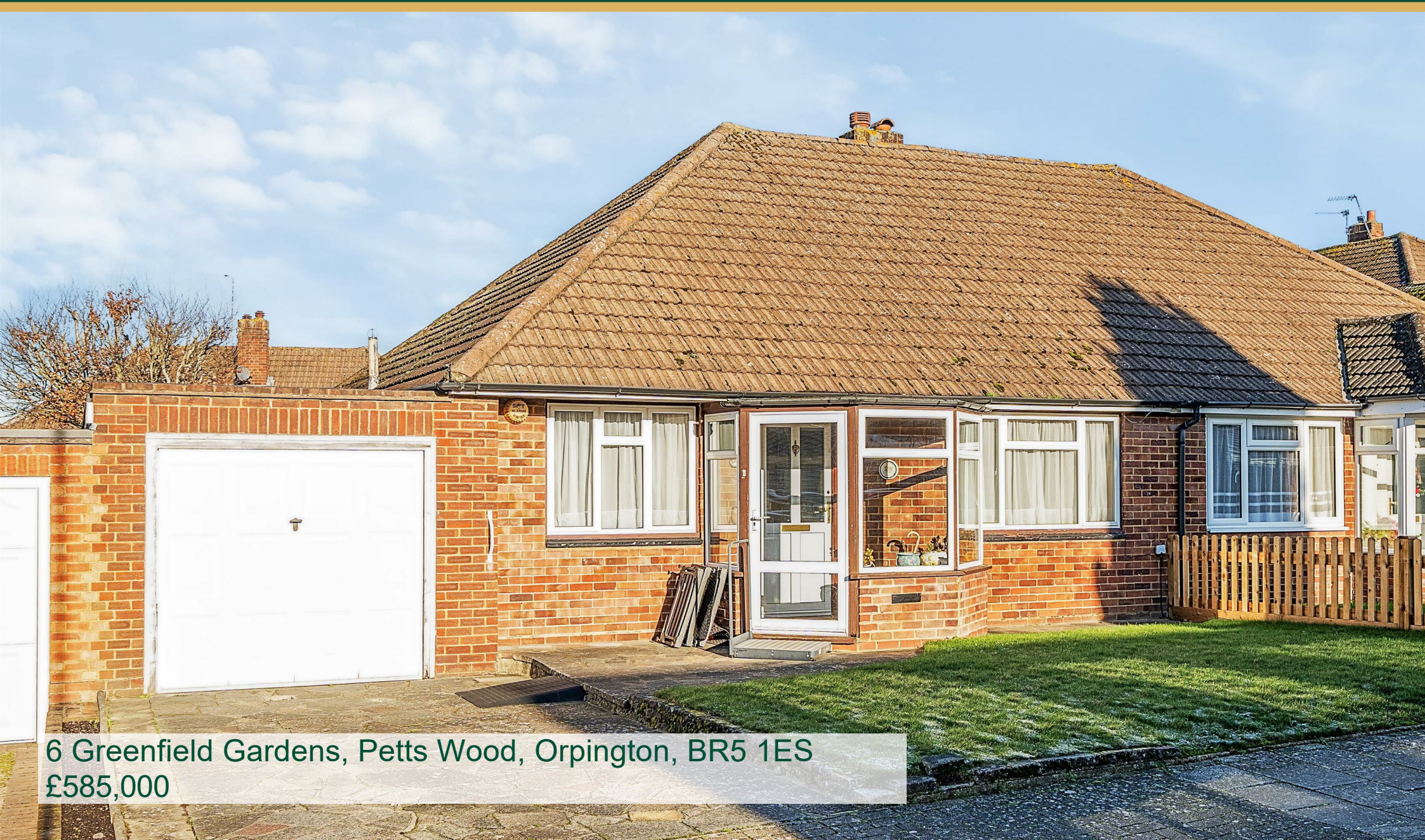
6 Greenfield Gardens, Petts Wood, Orpington, BR5 1ES £585,000