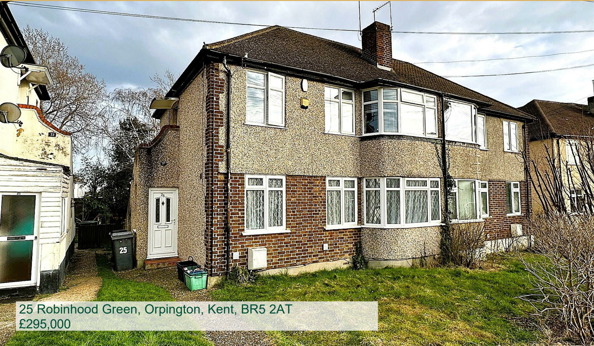
25 Robinhood Green, Orpington, Kent, BR5 2AT £295,000