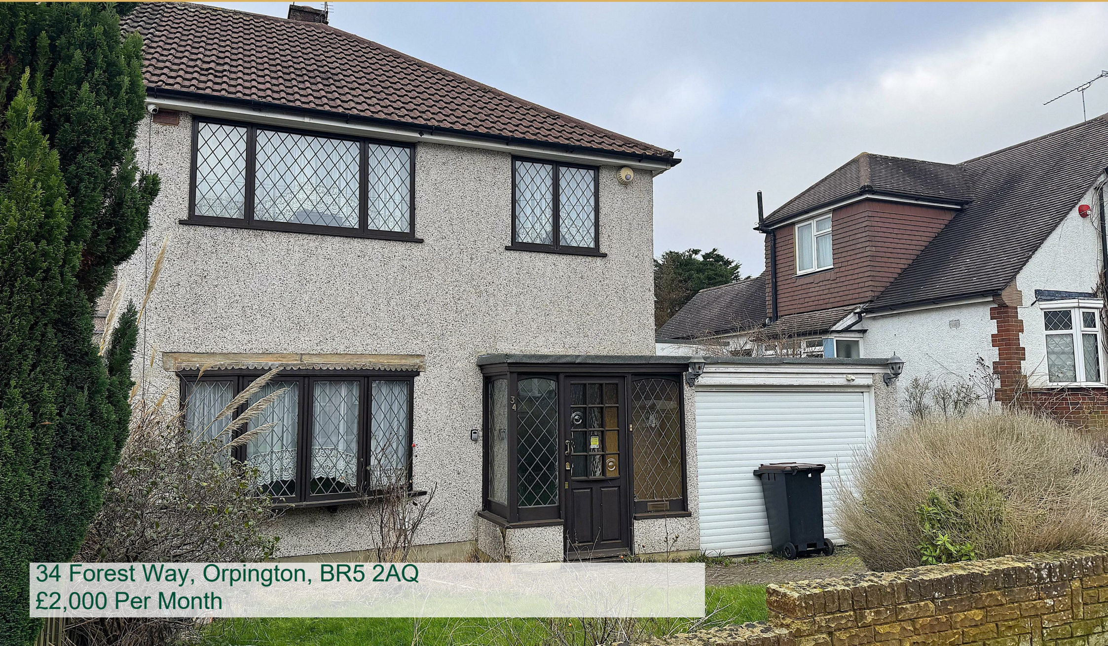
34 Forest Way, Orpington, BR5 2AQ £2,000 Per Month