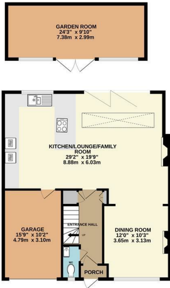
GROUND FLOOR 1173 sq.ft. (109.0 sq.m.) approx.