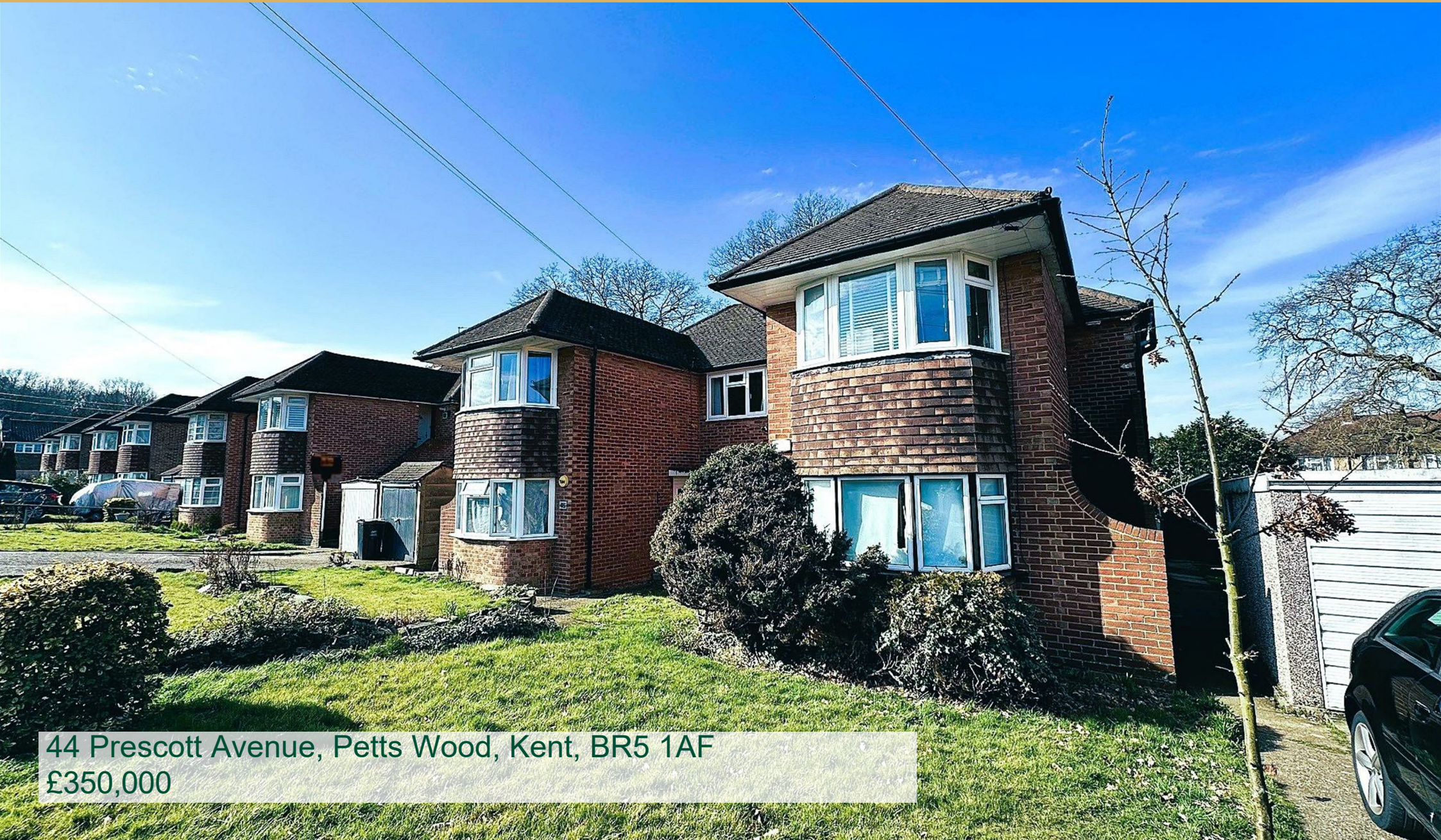
44 Prescott Avenue, Petts Wood, Kent, BR5 1AF £350,000