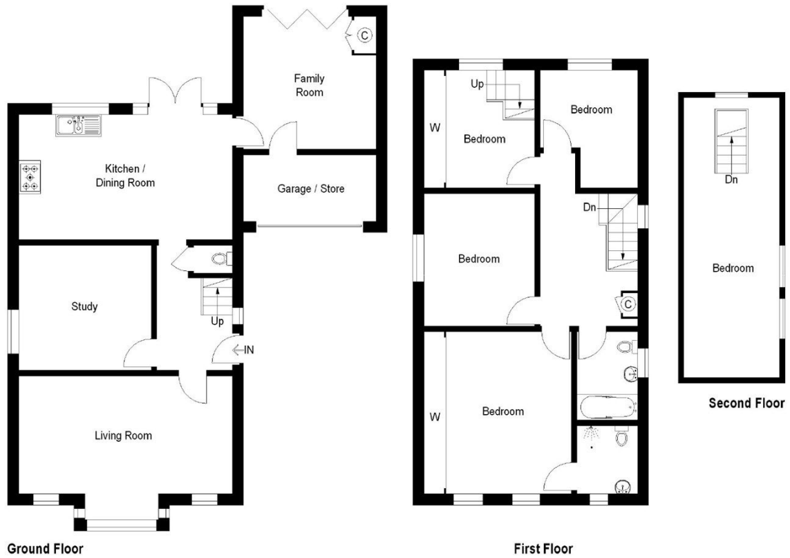
Illustration For Identification Purposes Only. Not To Scale (ID:294510 / Ref:58067)

Approximate Gross Internal Area 168.5 sq m / 1814 sq ft