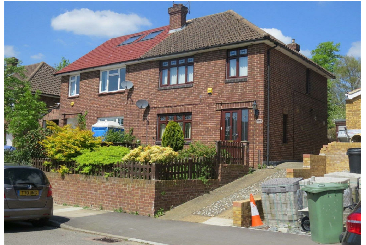
95 Cloonmore Avenue, Orpington, Kent, BR6 9LG