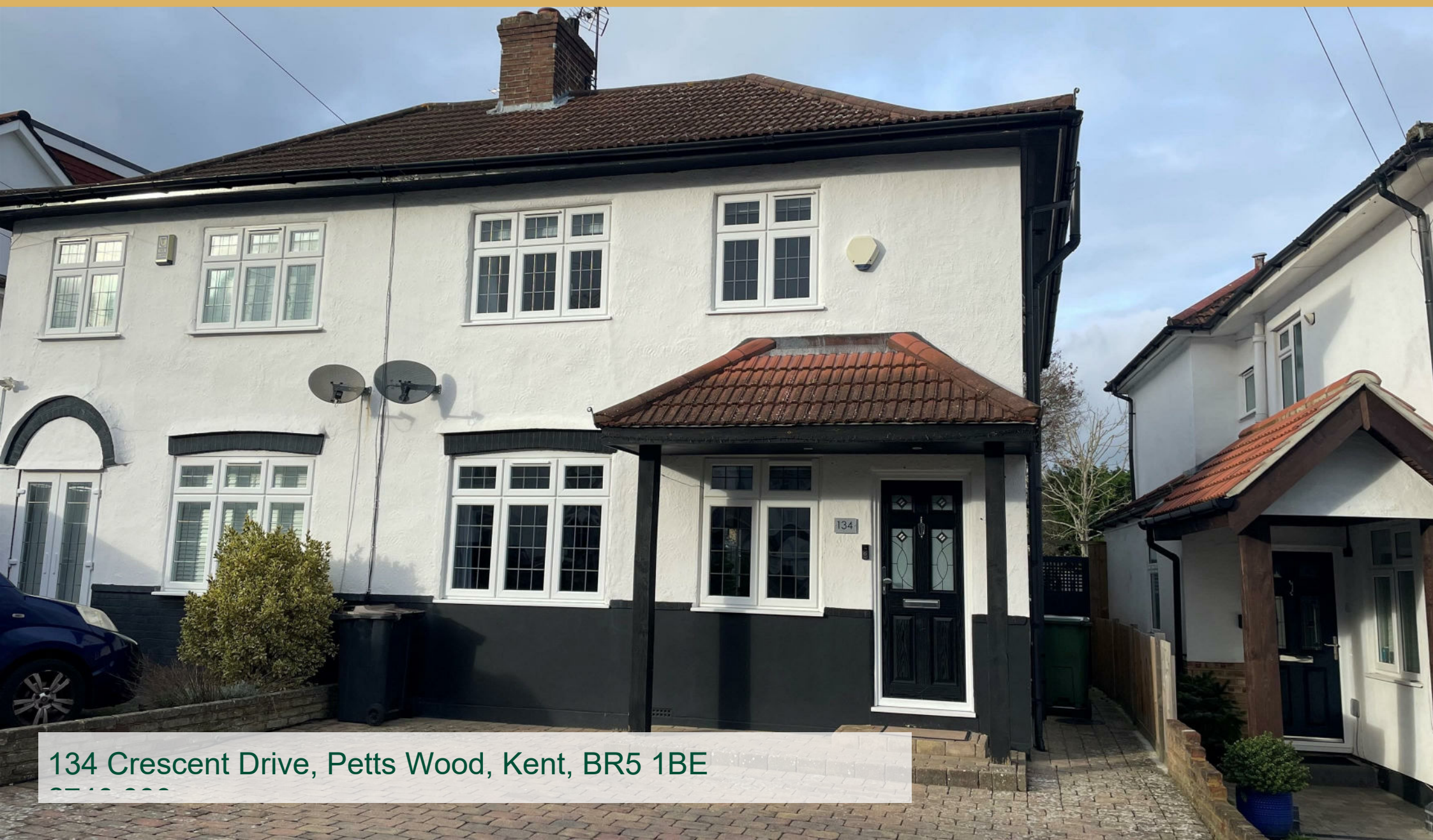
134 Crescent Drive, Petts Wood, Kent, BR5 1BE