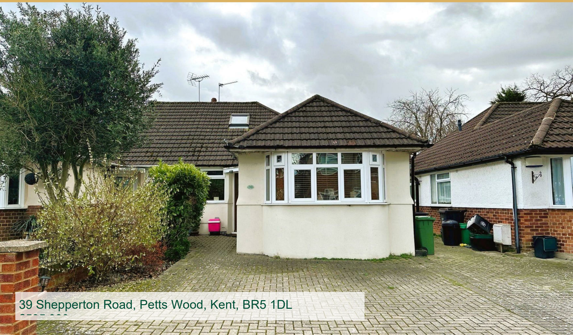
39 Shepperton Road, Petts Wood, Kent, BR5 1DL