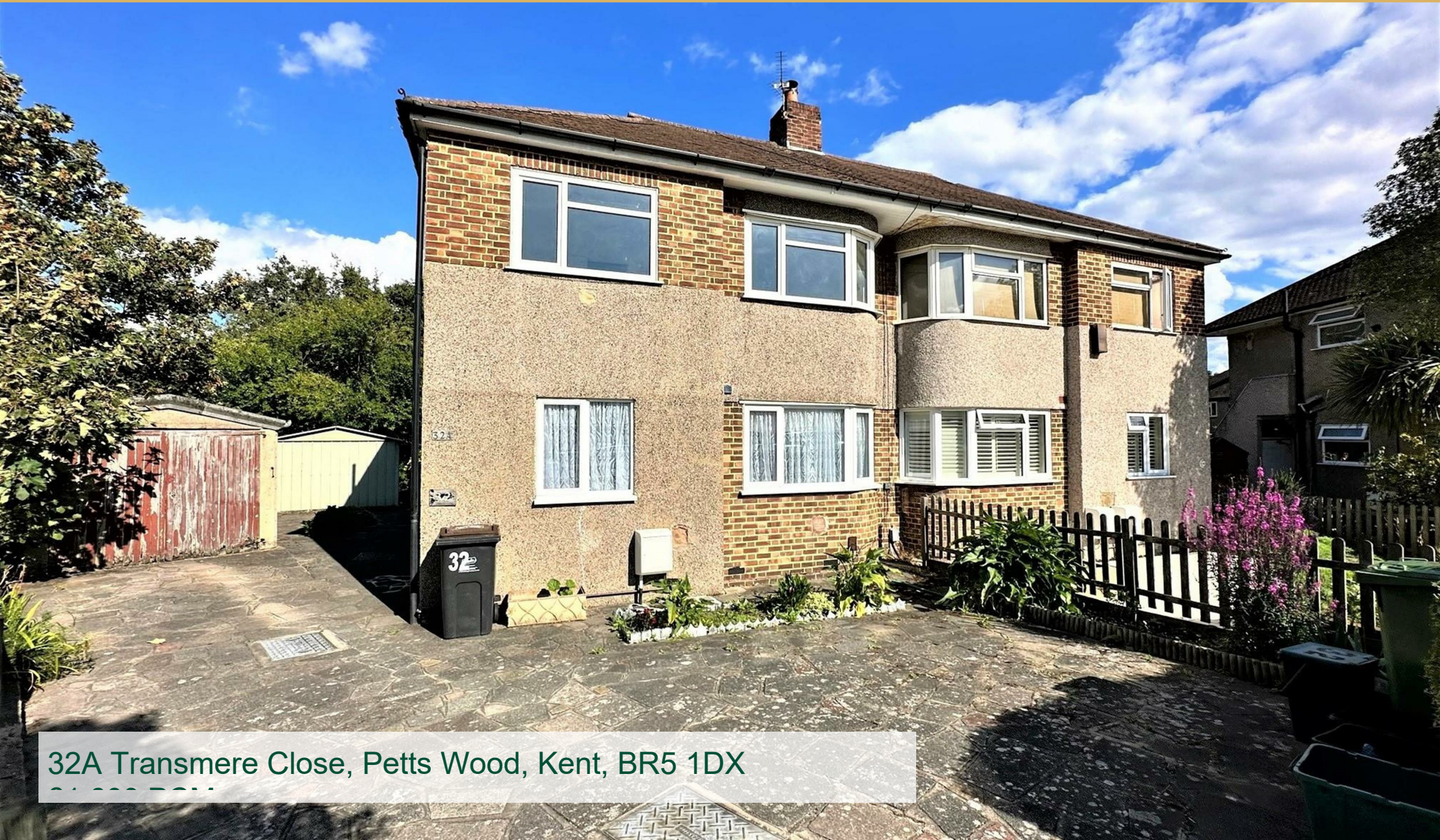
32A Transmere Close, Petts Wood, Kent, BR5 1DX