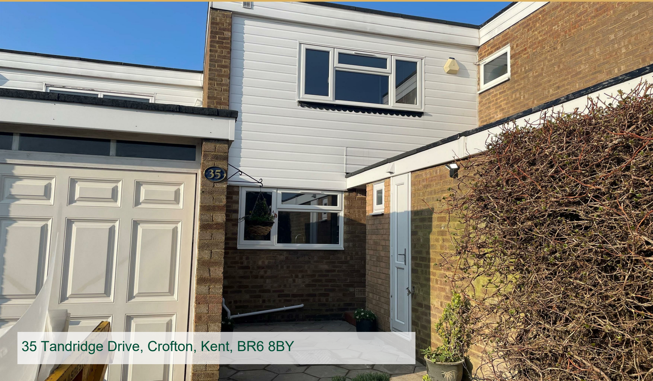
35 Tandridge Drive, Crofton, Kent, BR6 8BY