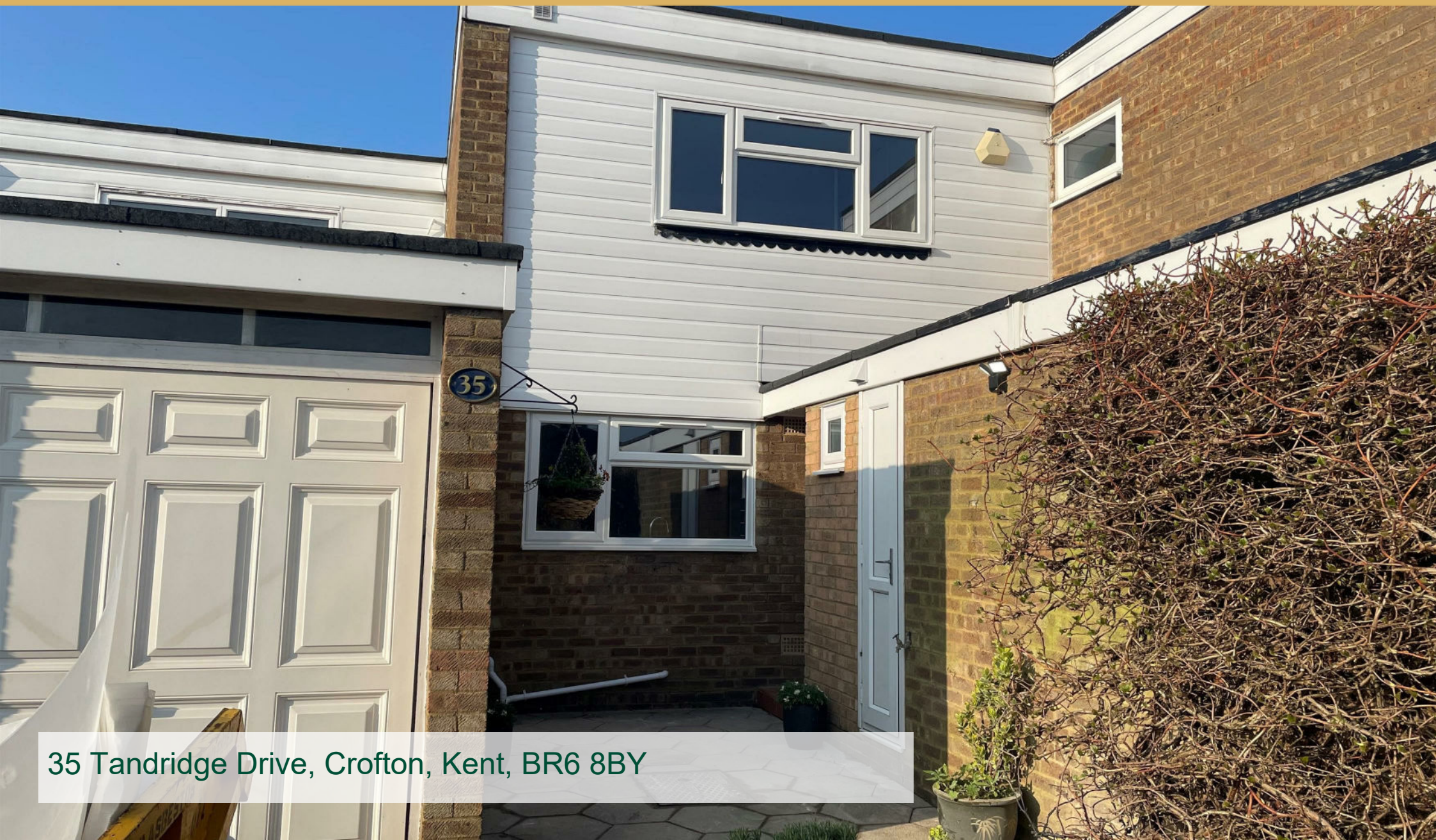
35 Tandridge Drive, Crofton, Kent, BR6 8BY