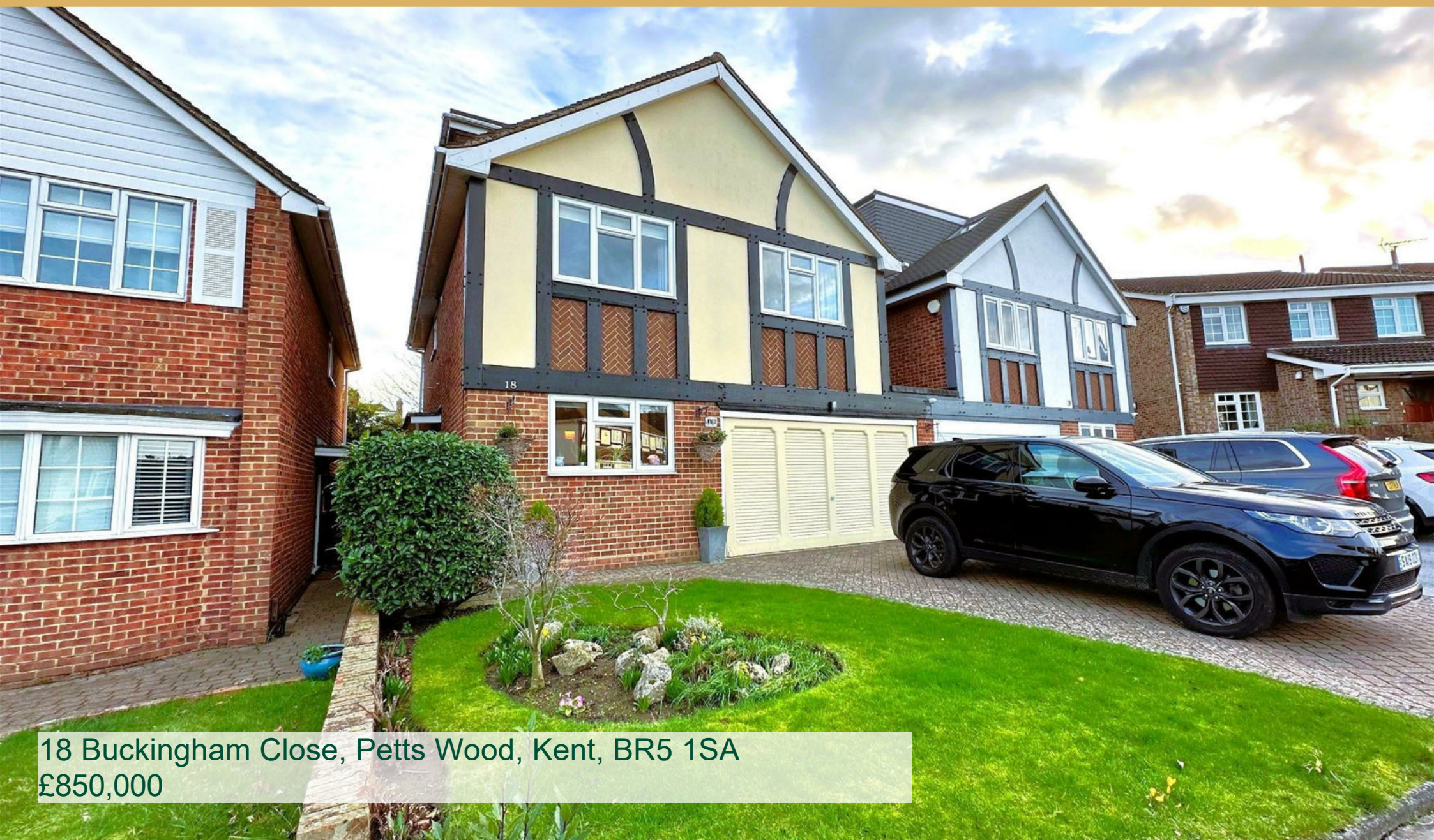
18 Buckingham Close, Petts Wood, Kent, BR5 1SA £850,000