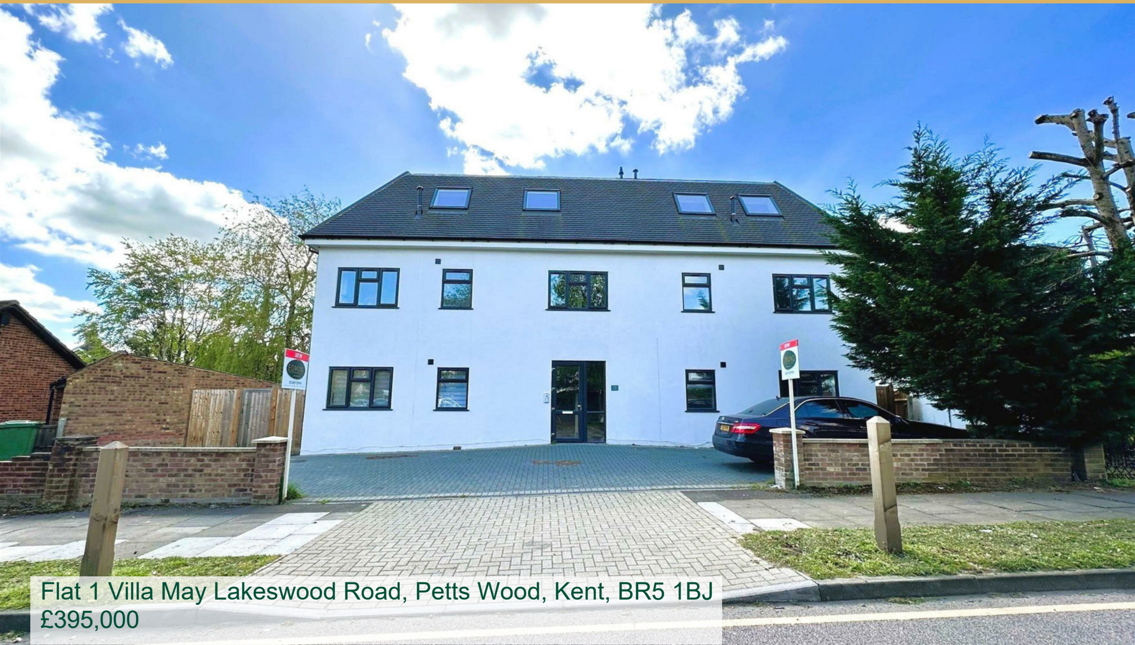
Flat 1 Villa May Lakeswood Road, Petts Wood, Kent, BR5 1BJ £395,000