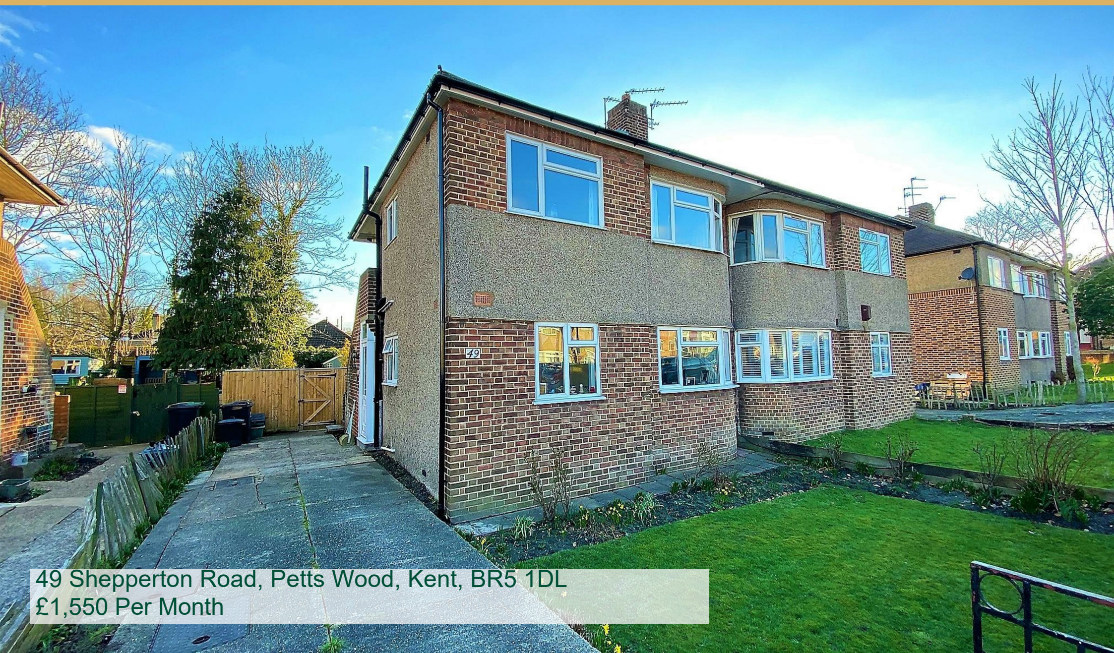
49 Shepperton Road, Petts Wood, Kent, BR5 1DL £1,550 Per Month