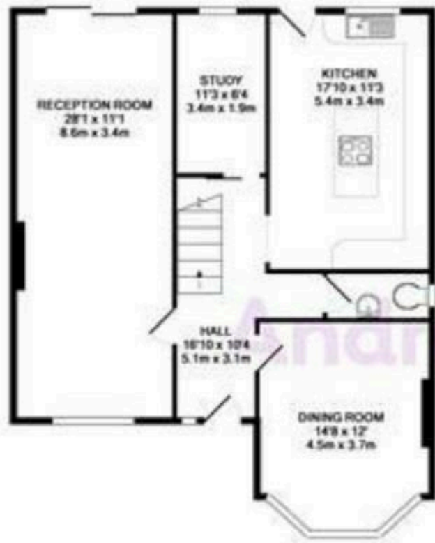
GROUND FLOOR APPROX. FLOOR AREA 880 SQ.FT. (81.7 SQ.M.)