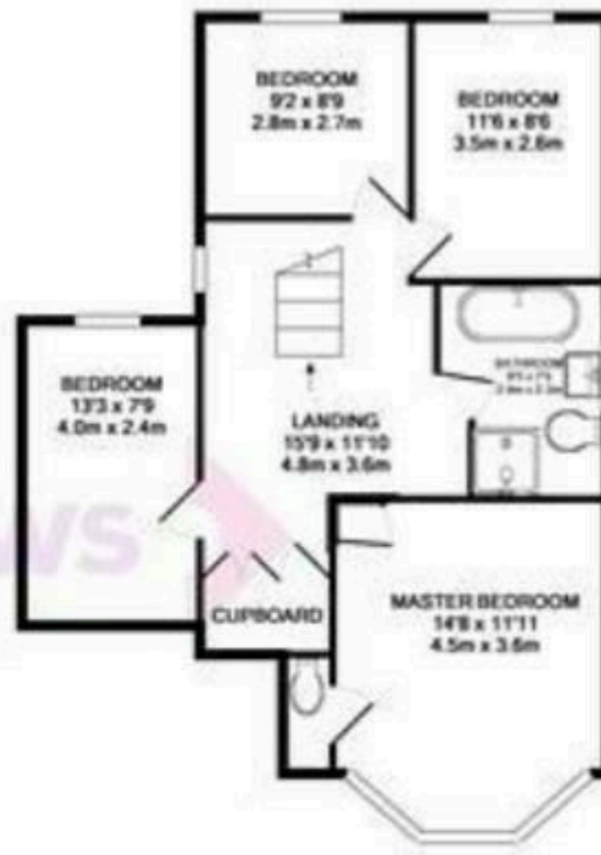
1ST FLOOR APPROX. FLOOR AREA 684 SQ.FT. (63.6 SQ.M.)

TOTAL APPROX. FLOOR AREA 1564 SQ.FT. (145.3 SQ.M.)