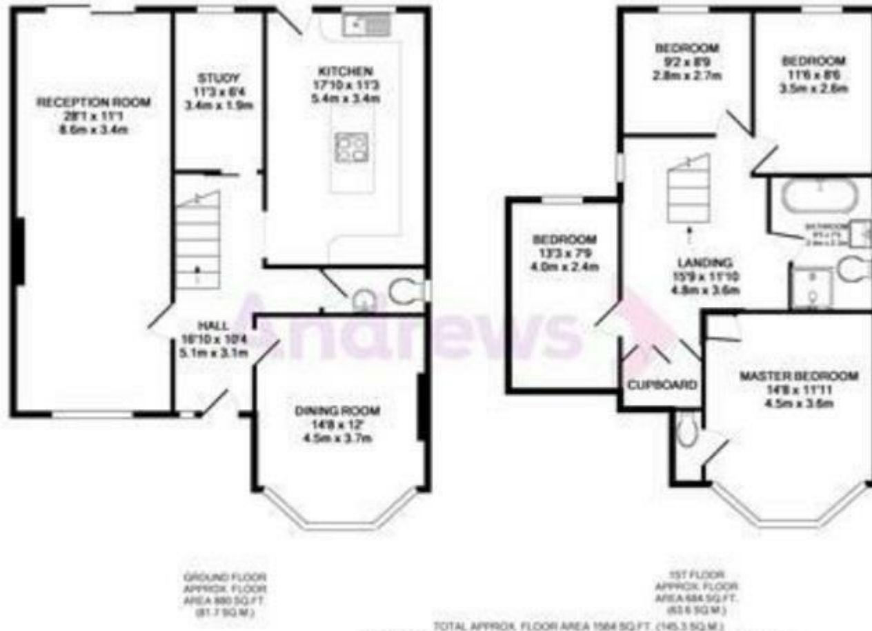
GROUND FLOOR APPROX. FLOOR AREA 880 SQ.FT. (81.7 SQ.M.)