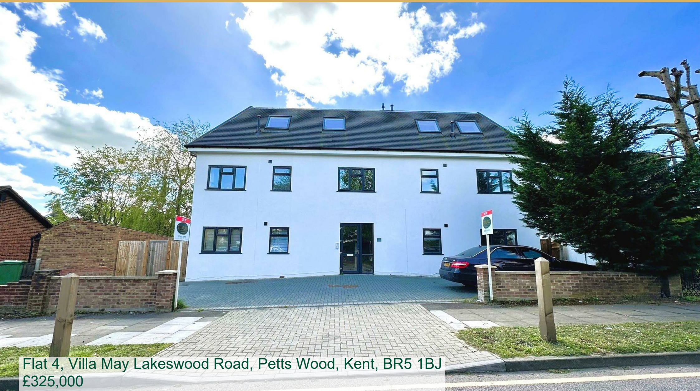
Flat 4, Villa May Lakeswood Road, Petts Wood, Kent, BR5 1BJ £325,000