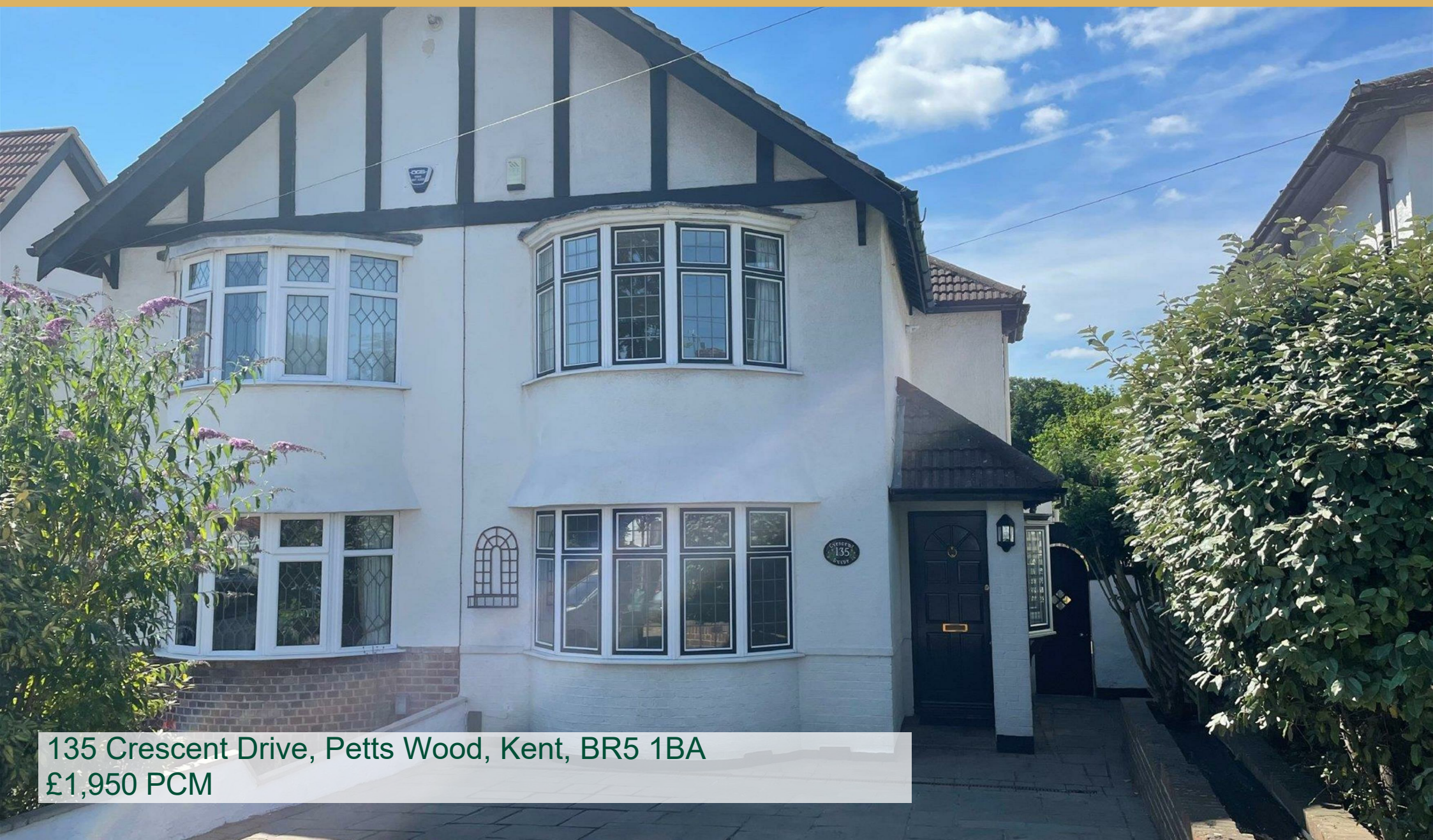
135 Crescent Drive, Petts Wood, Kent, BR5 1BA £1,950 PCM