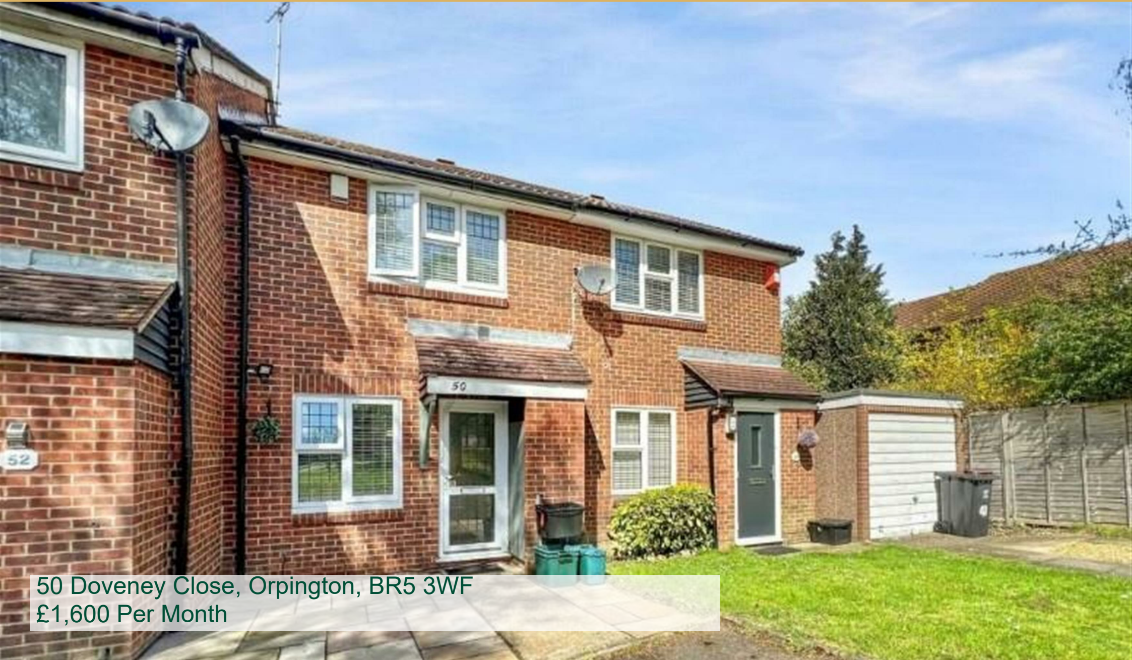
50 Doveney Close, Orpington, BR5 3WF £1,600 Per Month