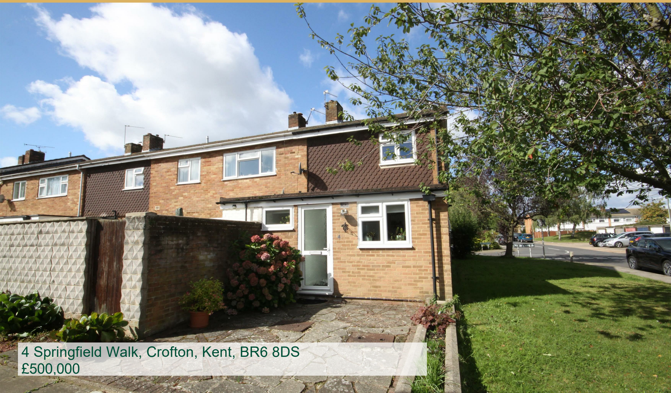
4 Springfield Walk, Crofton, Kent, BR6 8DS £500,000