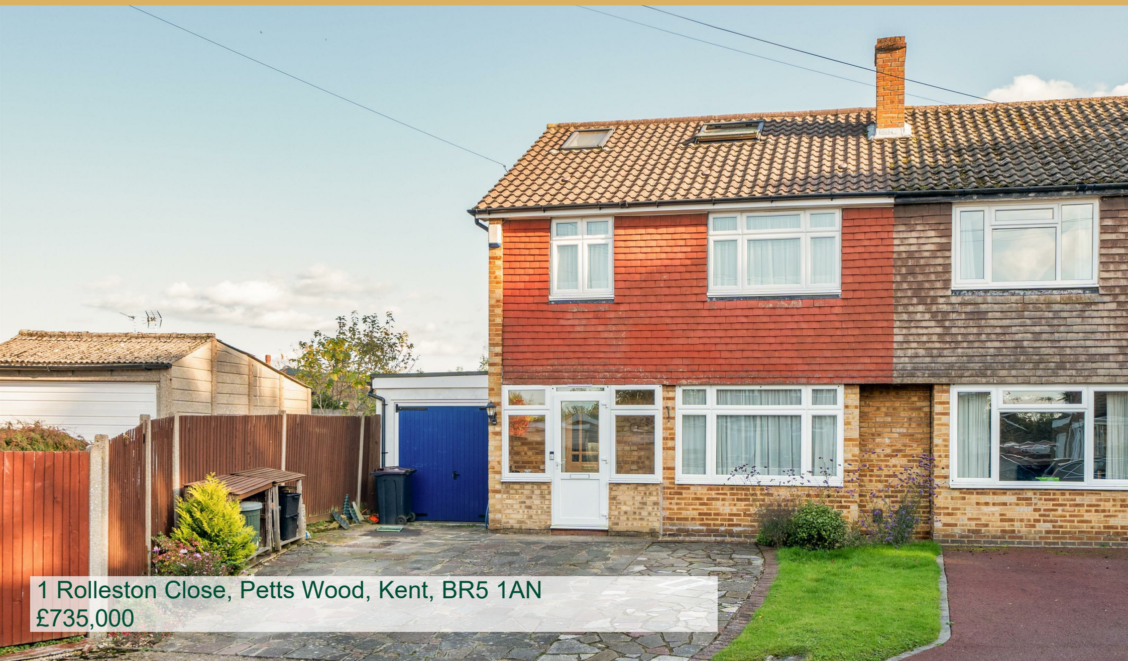
1 Rolleston Close, Petts Wood, Kent, BR5 1AN £735,000