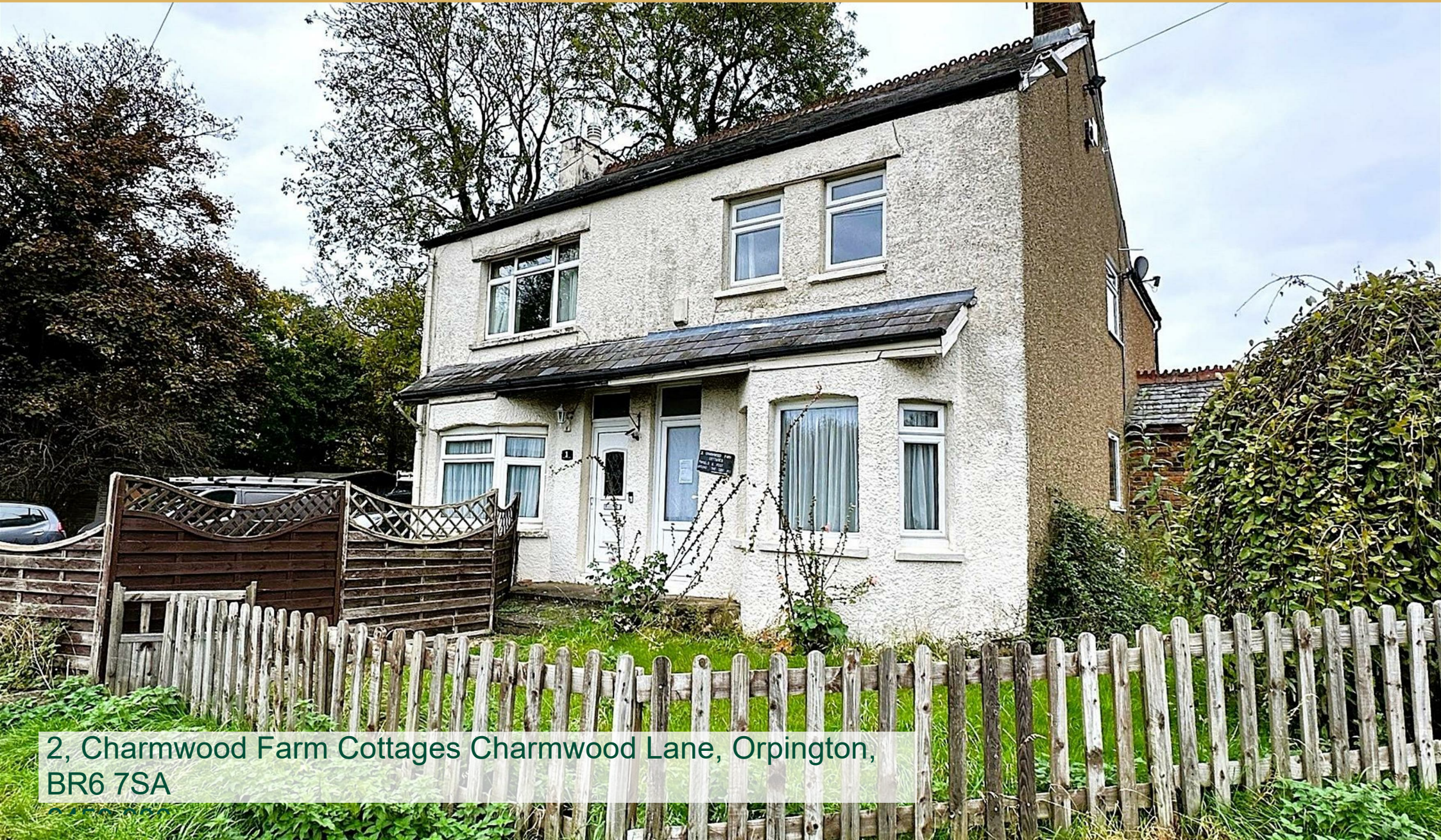
2, Charmwood Farm Cottages Charmwood Lane, Orpington, BR6 7SA