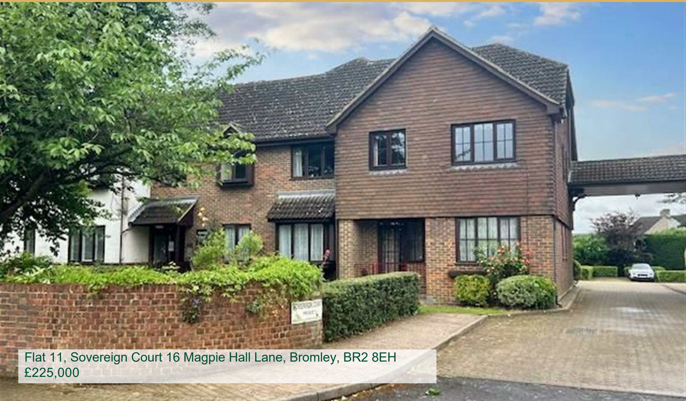
Flat 11, Sovereign Court 16 Magpie Hall Lane, Bromley, BR2 8EH £225,000